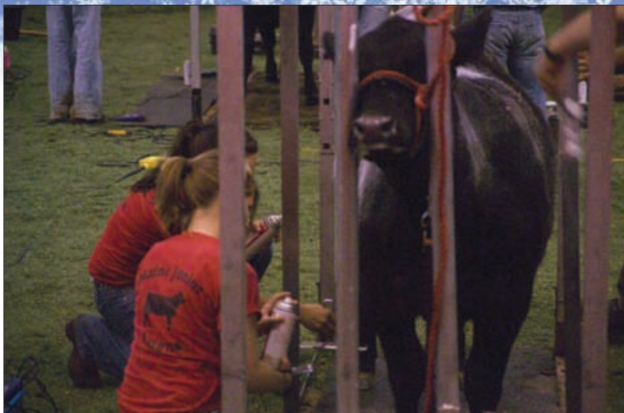
►Members learn teamwork and cooperation while competing in the team fitting contest.