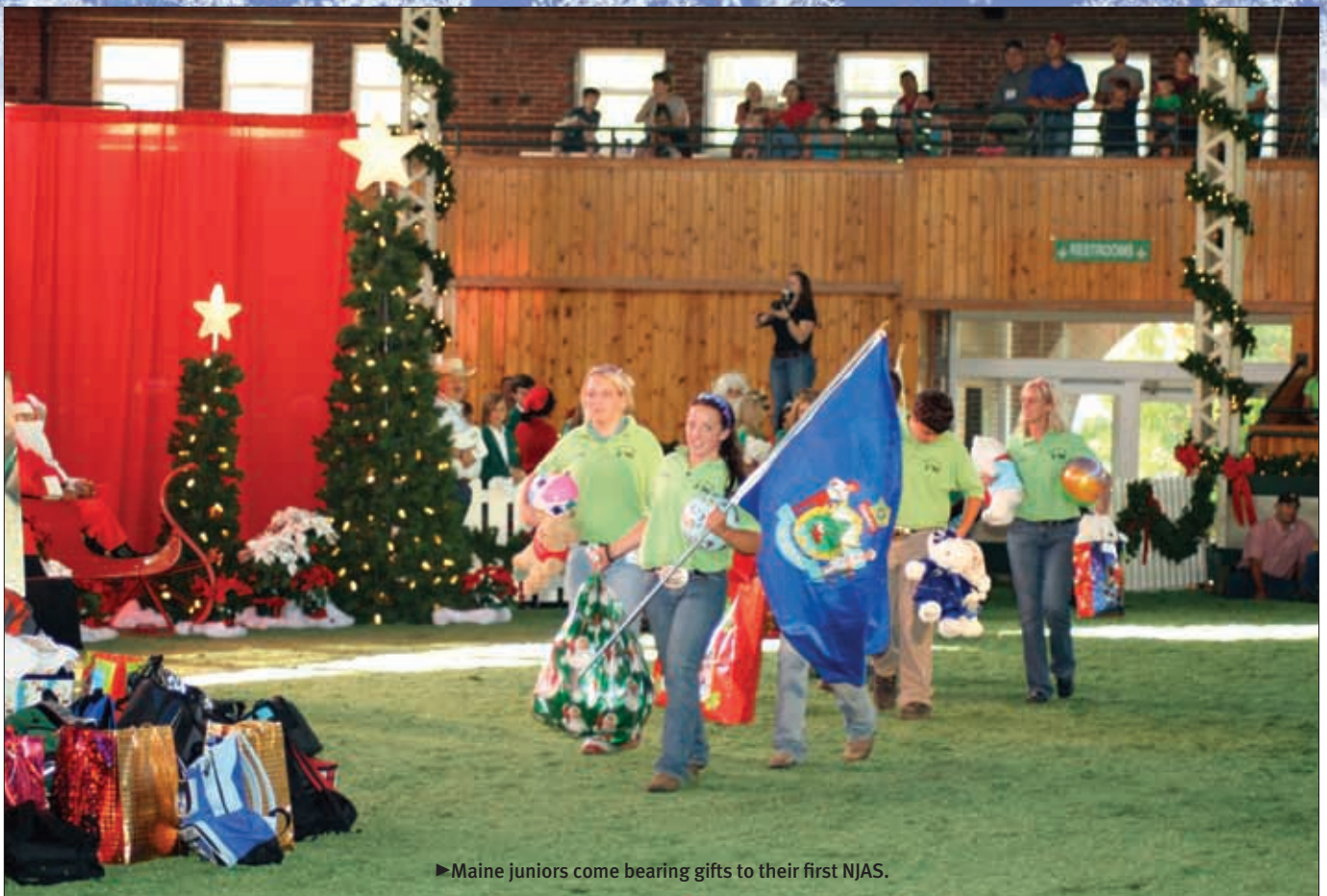
► Maine juniors come bearing gifts to their first NJAS.