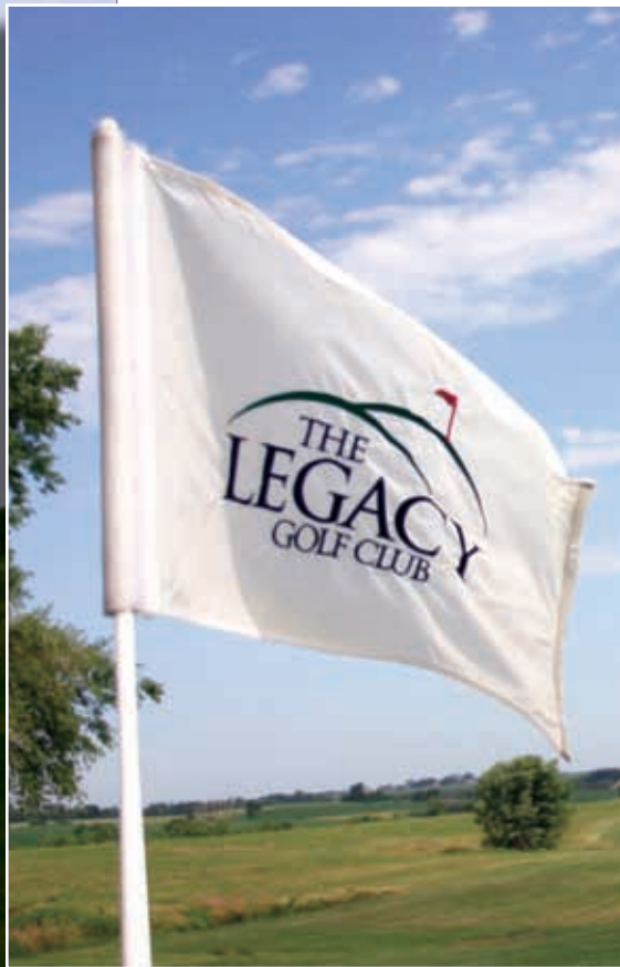
► Sunshine and a beautiful course kept players' and sponsors' spirits high as they raised more than $20,000 for the Angus Foundation's education, youth and research activities.