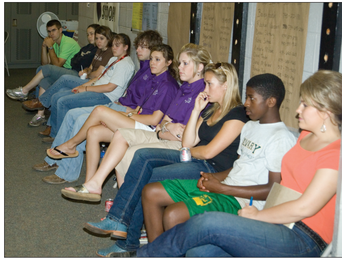
► Before one of their meetings, staff members listen to one of the industry professionals who came to speak during the week.