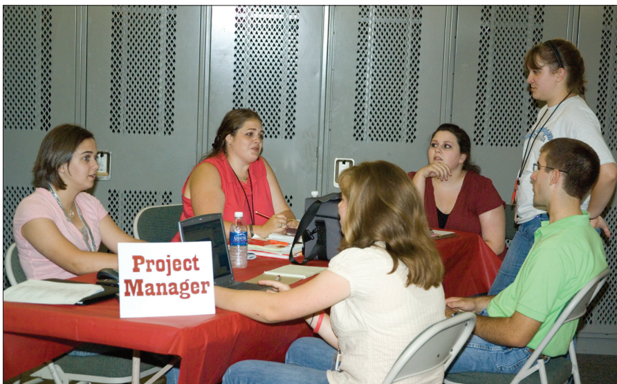
► Tossing around story ideas or just making new friends, The Scoop staff enjoyed working together.

"This may be a noncompetitive activity, but we still expect excellence from these juniors," French says. "We kept a level of professionalism but also kept that young feel to our publication."