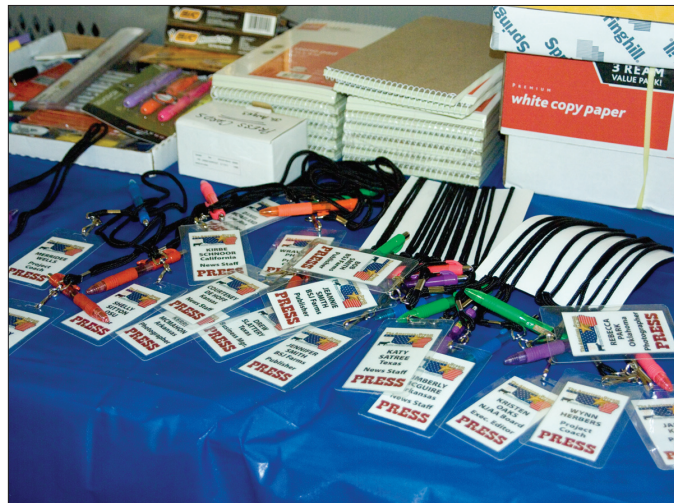
► Press badges, stenopads, and any other supplies needed for the production of a newspaper were provided.