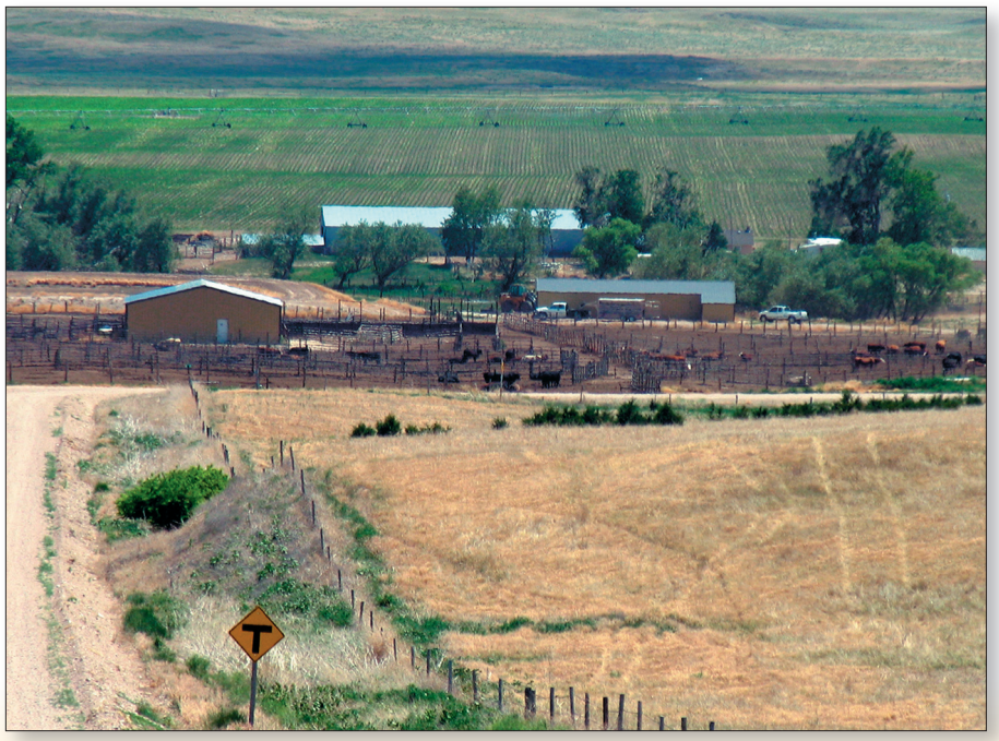
► The Wildcat Bluffs provide a scenic backdrop for the winding dirt road that introduces visitors to the ranch and leads them to the feedlot.

Lane adds, "It's our goal to provide whatever service our customers desire."