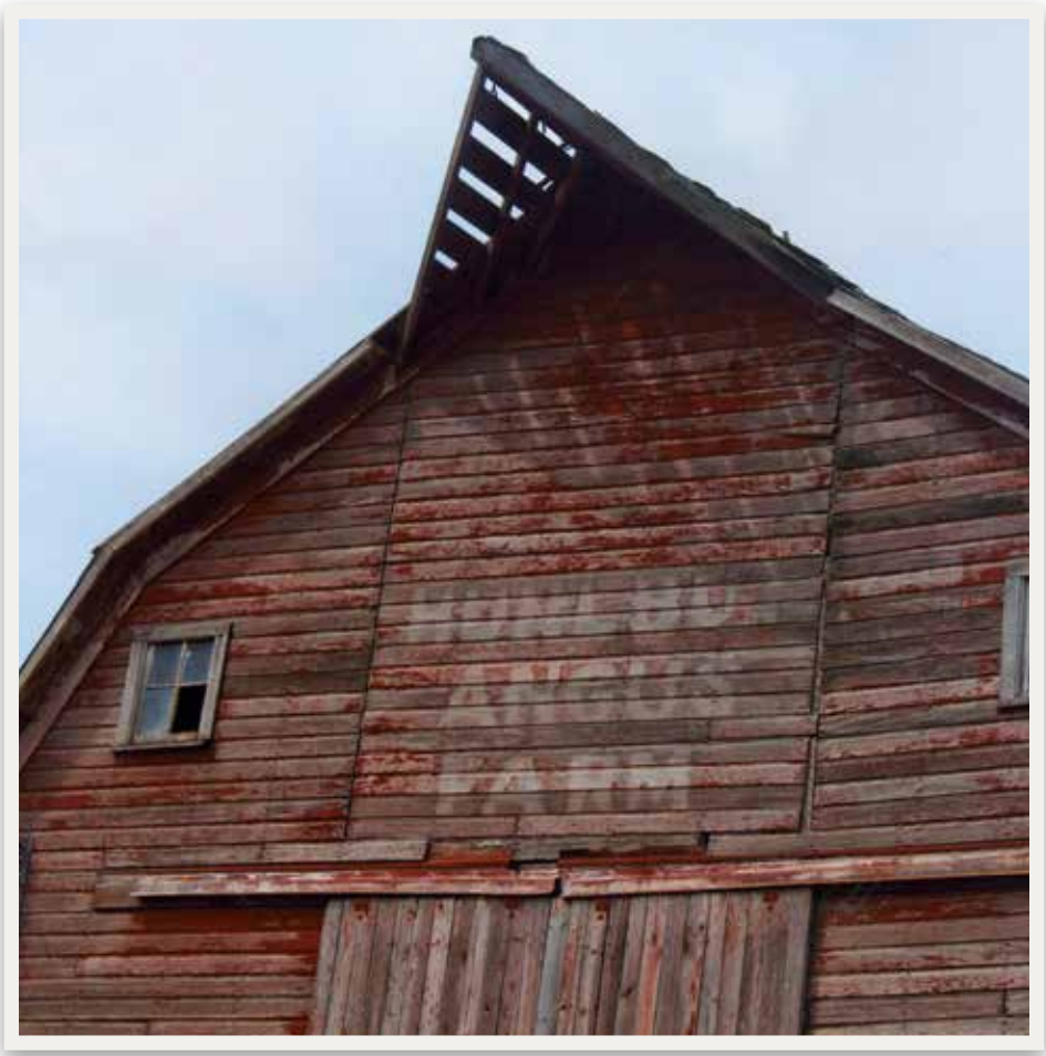
▶ Wyat James won the overall contest and junior division with 197 votes for "Generations of Angus Heritage."

Winners had their photos displayed as the Angus Journal Facebook page cover photo with recognition of the