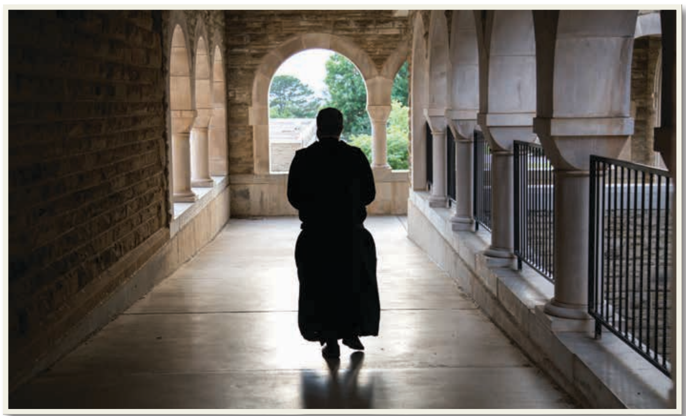
▶ The monks' days are strategically broken up to have four to five hours of prayer and seven to eight hours of work throughout the day. After breakfast they work for a few hours before cleaning up for Adoration and the Midday Prayer. They have a quick nap after lunch — if it's preferred — to gear up for an afternoon of work. The day wraps up after Vespers, the last prayer of the day, at 7:05 every evening.