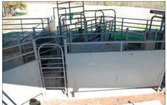
► Depending on how the gates are closed, the cattle are directed to the squeeze chute, the scales or the loading area.