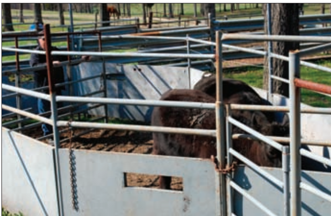
► Brewer built a sweep tub out of recycled steel doors and pipe.