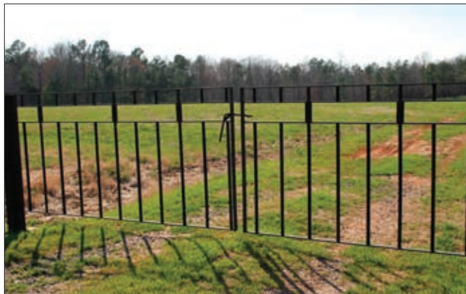
▶ Recycled computer cable racks can be turned into excellent gates.

Oklahoma State and the University of Kentucky provide excellent information on cattle handling facilities at: http://pods.dasnr.okstate.edu/docushare/dsweb/Get/Document-1998/F-1219web.pdf and www.ca.uky.edu/agc/pubs/aen/aen82/aen82.pdf .