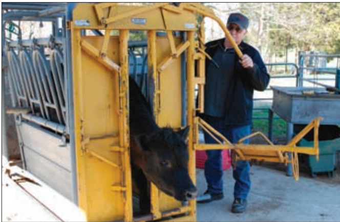
▶ A manual headgate works fine at Mile Away Farm.