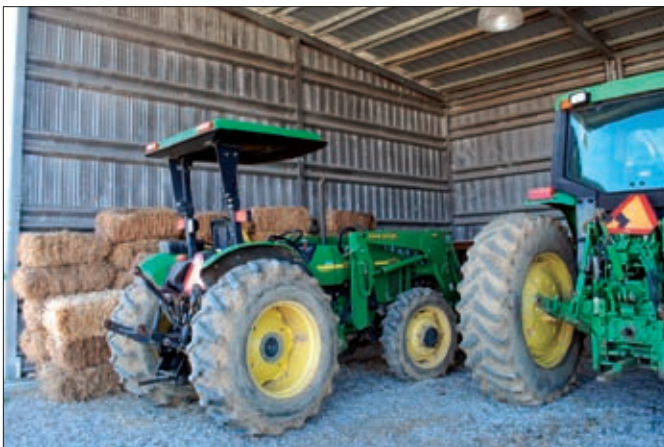
▶ After building the cattle facility, Brewer used guardrails to make a shed.