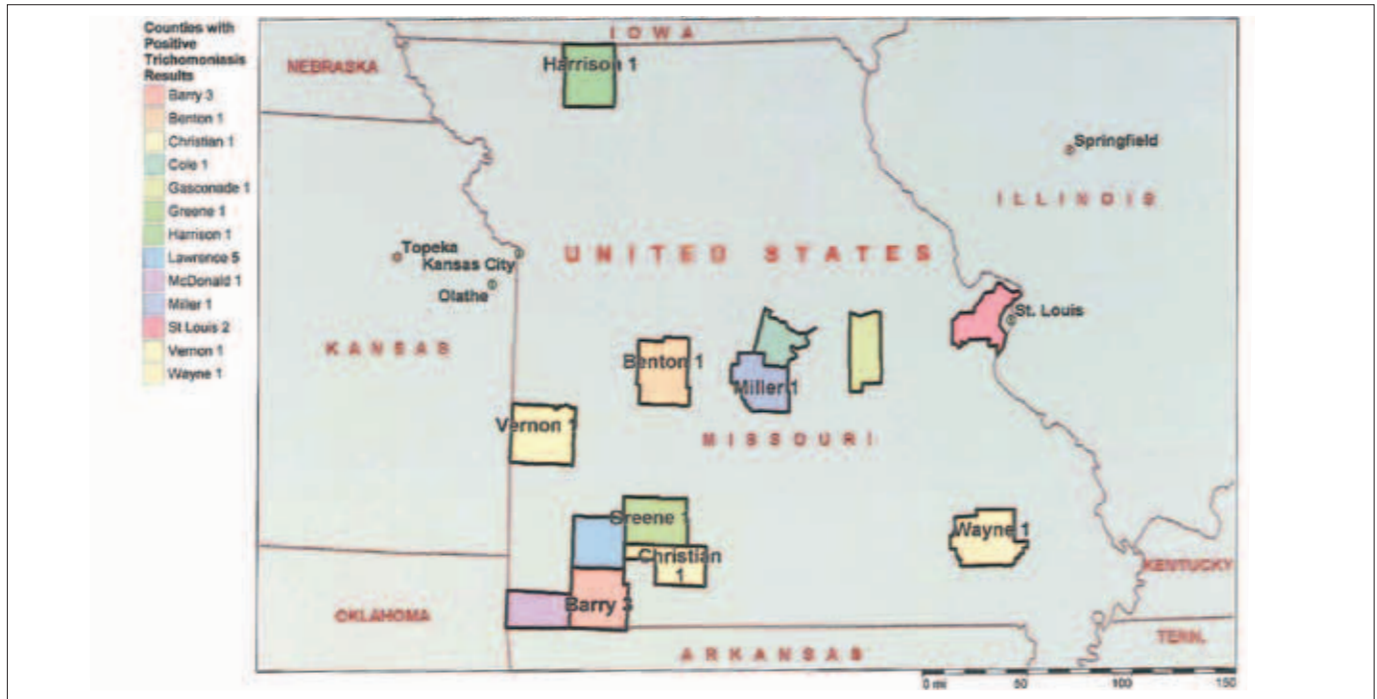
Fig. 1: Counties with incidents of positive trichomoniasis test results, March 2010 - April 2010