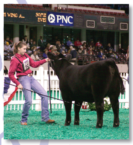
► Above: The ROV show/National Show continued on Tuesday with the female show.

Editor's Note: Asterisks (*) denote appointments made after the NAILE and announced in December.