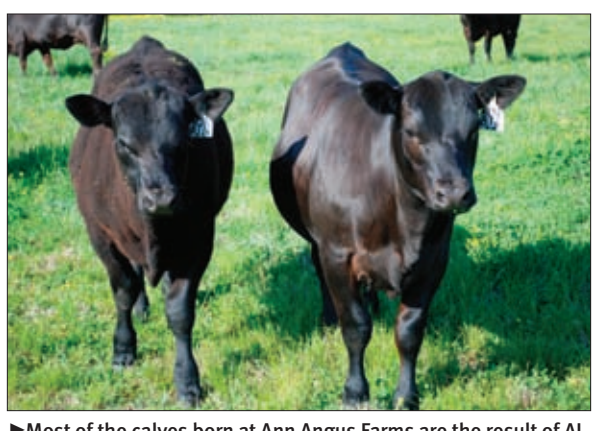
►Most of the calves born at Ann Angus Farms are the result of AI.