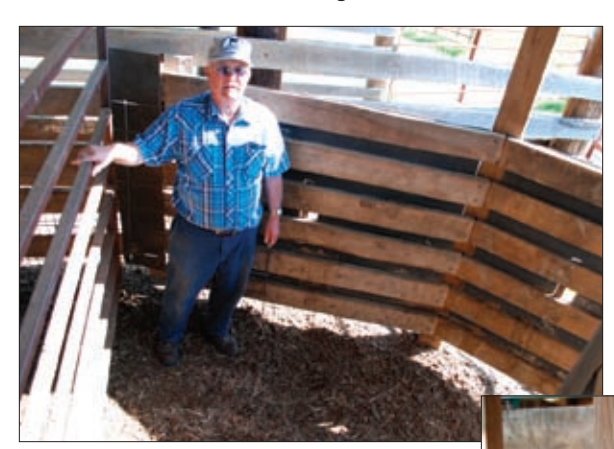
►Above: A 10-foot sweep gate guides the cows to the entrance of the alley.