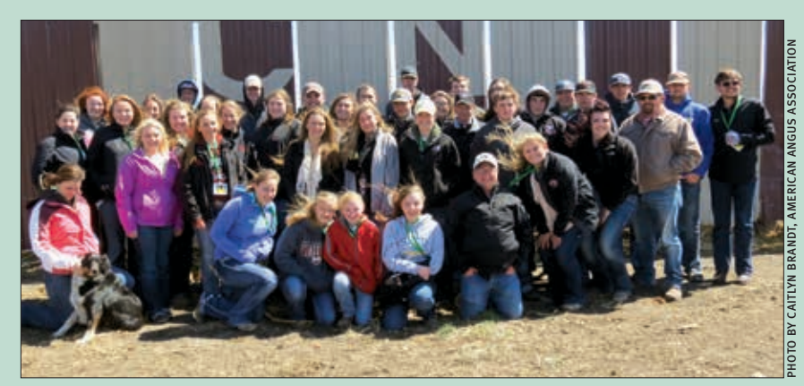
► Above: Angus youth gathered at the 2016 Raising the Bar Officer Training April 7-10 in Sioux Falls, S.D. Nearly 40 juniors from 13 state junior Angus associations participated in the course, geared toward building stronger leaders while forming important regional relationships. The group is pictured at Chestnut Angus Farm, Pipestone, Minn.

▶ Right: Raising the Bar at the University of Arkansas welcomed more than 20 juniors to Fayetteville, Ark., where they toured the animal science department on campus. The group is pictured at JAC's Ranch, Bentonville, Ark.