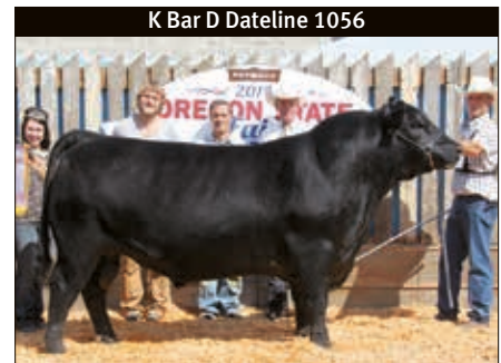
K Bar D Dateline 1056