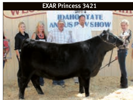
EXAR Princess 3421