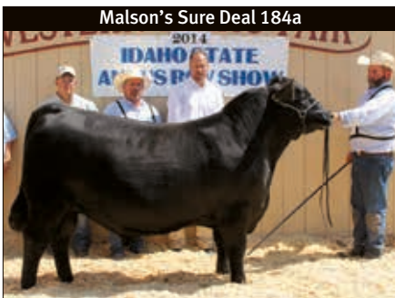
Malson's Sure Deal 184a