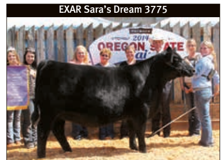
EXAR Sara's Dream 3775