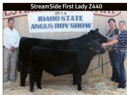
StreamSide First Lady Z440