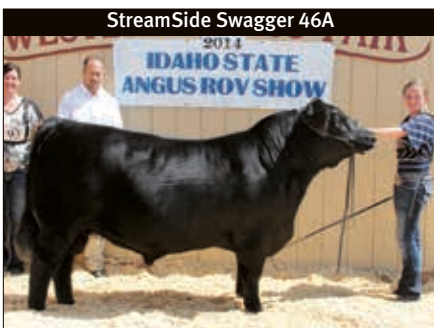
StreamSide Swagger 46A