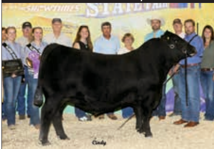
Dameron CB First Responder