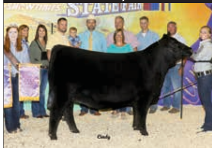
Dameron C-5 Cheyenne 1628