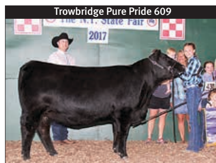
Trowbridge Pure Pride 609