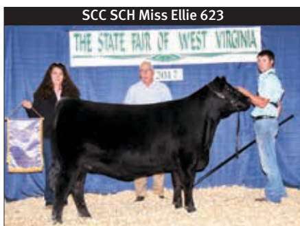
SCC SCH Miss Ellie 623