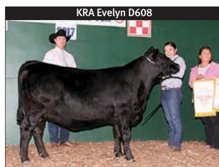
KRA Evelyn D608

dam with progeny of Equity 38 Dutchess Joy NCC1.