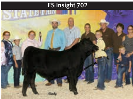
ES Insight 702