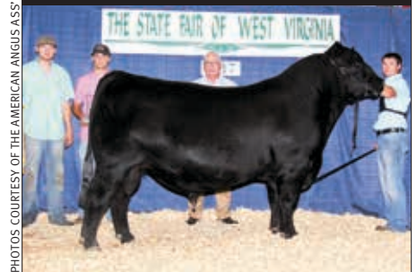
SCC Tradition of 24