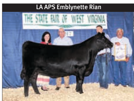
LA APS Emblynette Rian