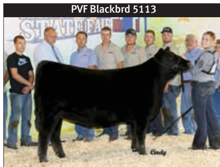
PVF Blackbrd 5113