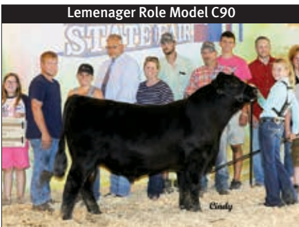
Lemenager Role Model C90