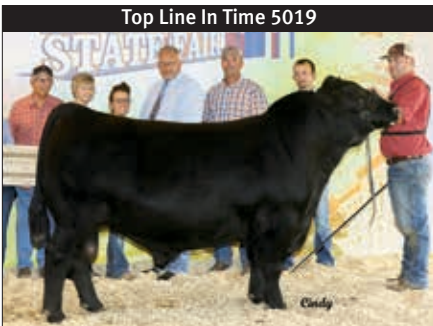
Top Line In Time 5019