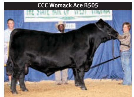
CCC Womack Ace B505