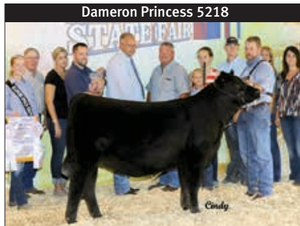
Dameron Princess 5218