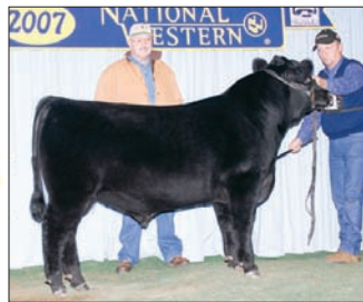
►Reserve late spring calf champion, KG Integrity 648 , by Kenton Goeglein, Yuma, Colo.