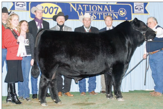
► Reserve grand champion bull, WCC Midtown R220 , by Wilson Cattle Co., Cloverdale, Ind. He's a Nov. 2005 son of BR Midland.