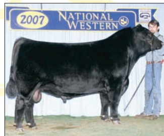
►Reserve late spring champion, WCC Capitalist R108 , by Wilson Cattle Co., Cloverdale, Ind.