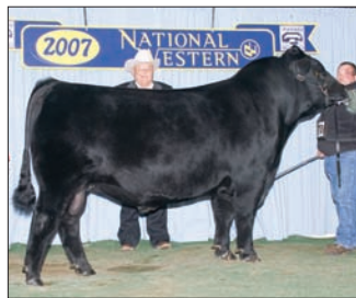
► Winter champion, Da-Es-Ro Frontier 5018 211 , by Da-Es-Ro Angus Farms, Columbus Junction, Iowa.