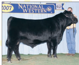
►Reserve early winter calf champion, Pine Ridge 5321 K347 , by Pine Ridge Farms, Omega, Ga.