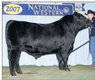
► Reserve winter champion, Riverbend Top Hand , by Riverbend Ranch, Idaho Falls, Idaho.