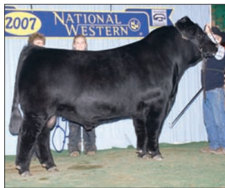
► Early spring champion, MLO Expand 509 , by Owings Cattle, Powell Butte, Ore.