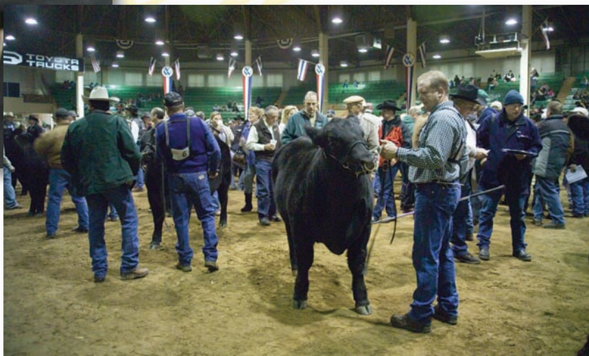
► Right: All the bulls are brought back into the ring after the show. The gates are opened and onlookers stream into the ring to personally inspect the bulls.