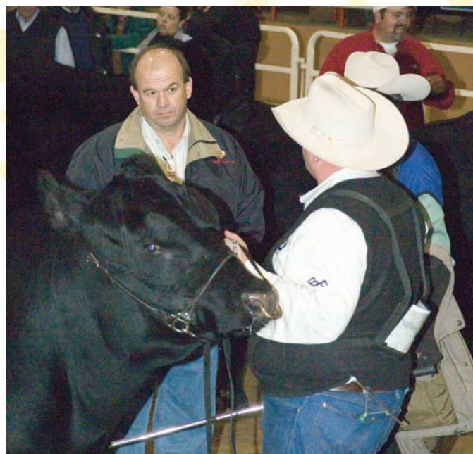
► Above: The sale bull viewing allows the audience to visit with the owners of the bulls.