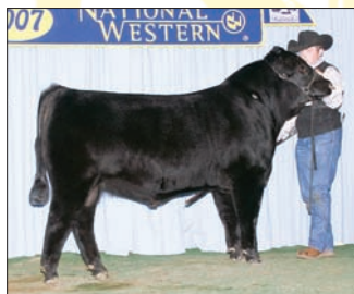
►Reserve late winter calf champion, PF 2445 Midland 6007 , by Polard Farms LLC, Enid, Okla.