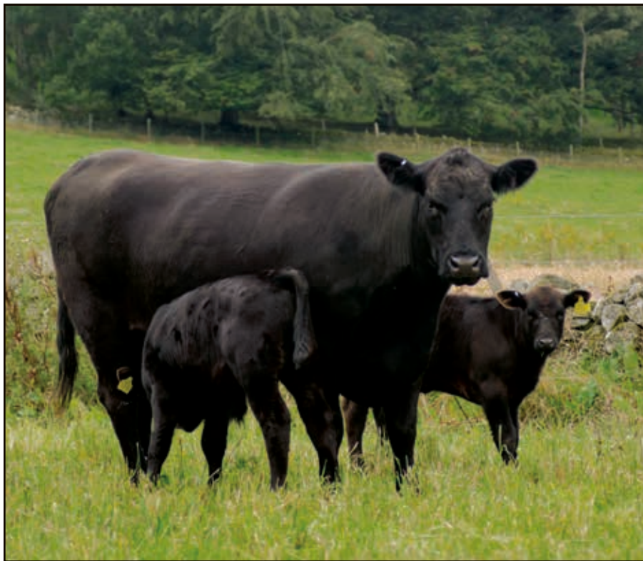
Fig. 1: Find the Angus Optimal Milk Module under the Management tab at www.angus.org