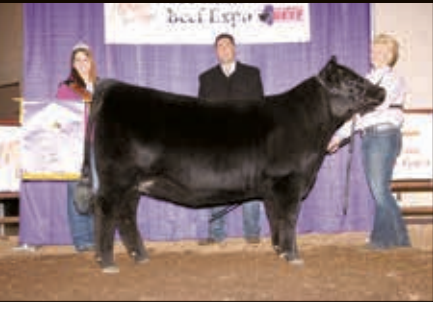
Dameron Simply Forever 3140