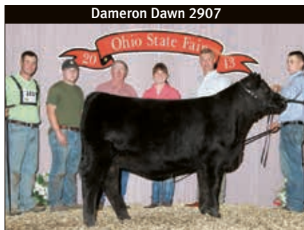
Dameron Dawn 2907