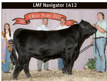
LMF Navigator 1412