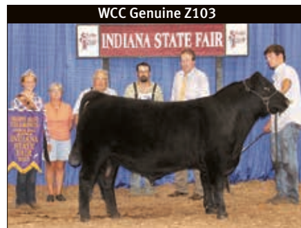
WCC Genuine Z103