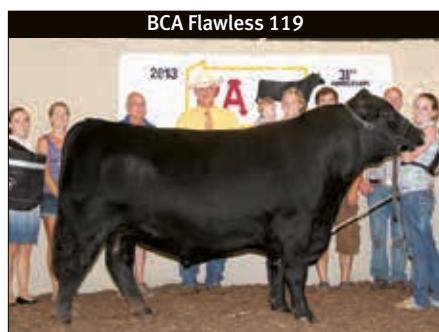
BCA Flawless 119