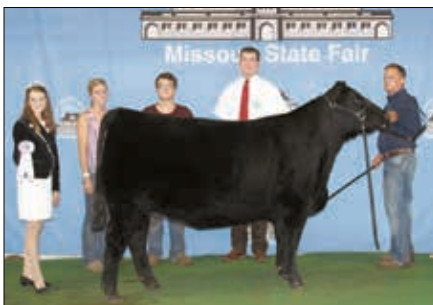
► Reserve grand champion female, PVF Missie 2018 .