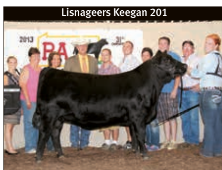
Lisnageers Keegan 201