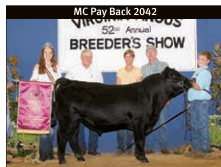
MC Pay Back 2042