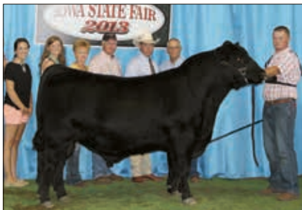
►Reserve grand champion bull, Schroeder Hugo 3412 .