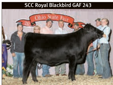
SCC Royal Blackbird GAF 243