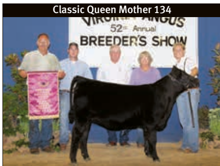
Classic Queen Mother 134