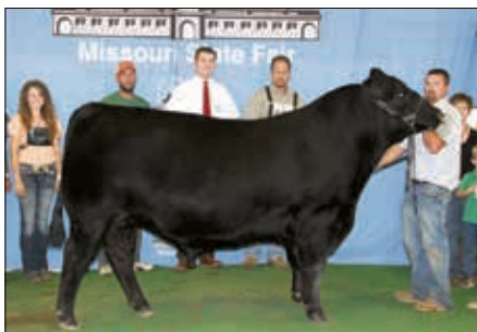
► Reserve grand champion bull, Clearwater Final Prod 1221 .