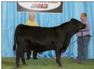
► Intermediate champion, Da-Es-Ro 7W 12117 , by Da-Es-Ro Angus Farms.