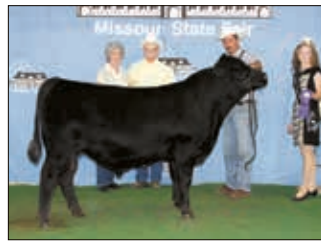
► Senior calf champion, Wallace Challenger 280 , by Wallace Cattle Co., Stotts City, and Carriers Muddy Creek Angus Farm, Lockwood.