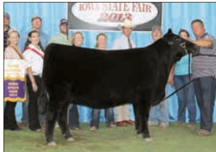
►Grand champion female, PVF Missie 2078 .