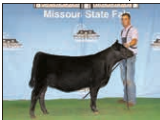
► Junior calf champion, Meyer Rita 1305 , by Meyer.