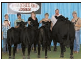
► First-place get-of-sire, progeny of Buffalo's Pro Bull BN88 , by Schermer Angus, Clarion.