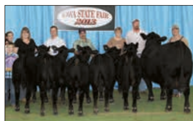
► Best six head, Schermer Angus .