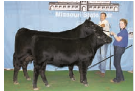
► Grand champion cow-calf pair, Checkerhill Viola X42 .