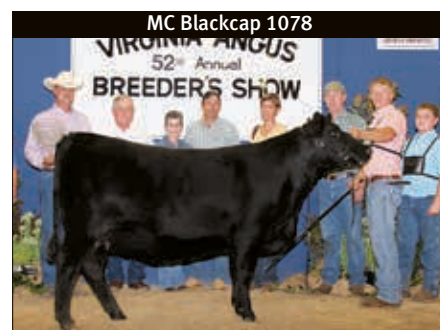
MC Blackcap 1078