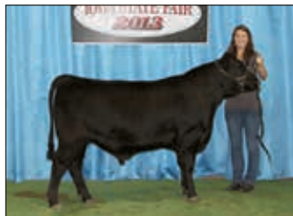
► Reserve intermediate champion, WPAF 780 Ambush 529-2110 , by Wiederstein Pure Angus Farm, Audubon.