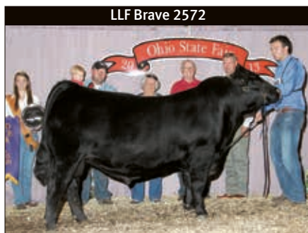
LLF Brave 2572