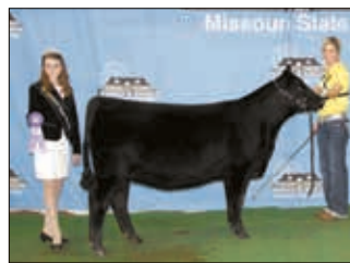
► Senior calf champion, Hunter's Diamond Mercedes 233 , by Purebred Livestock Services.