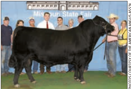
► Grand champion bull, 74-51 Sudden Look 1023 .