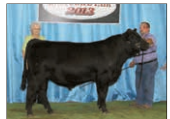
►Reserve senior calf champion, Da-Es-Ro Mr. 7W 12127 , by Da-Es-Ro Angus Farms.