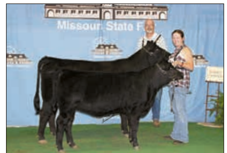
► Reserve grand champion cow-calf pair, Prairie Hollow Gal S111 .