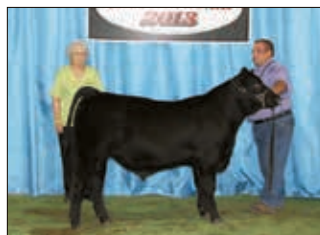
►Reserve junior calf champion, Da-Es-Ro Cosmo 1302 W06 , by Da-Es-Ro Angus Farms, Columbus Junction.