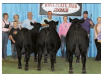
► First-place junior get-of-sire, progeny of Duff Hobart 8302 , by Webster Farms, Walker.