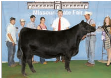
► Grand champion female, Wallace Princess 169 .