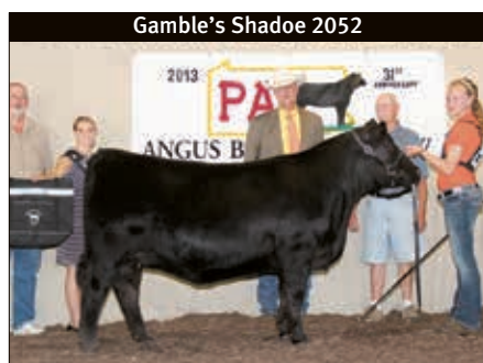
Gamble's Shadoe 2052