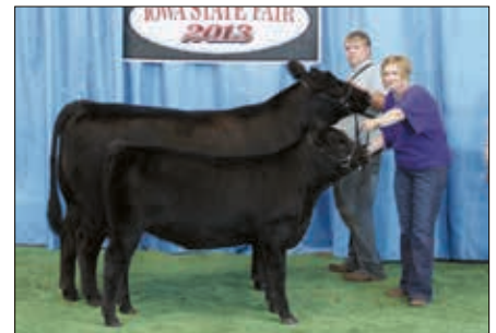
►Reserve grand champion cow-calf pair, Birks Forever Lady 21 .