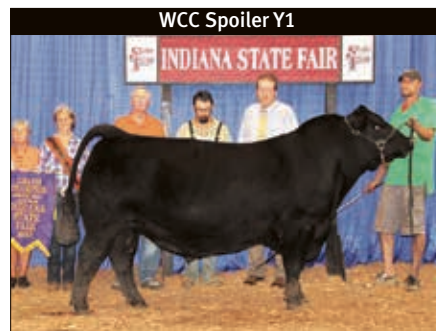
WCC Spoiler Y1