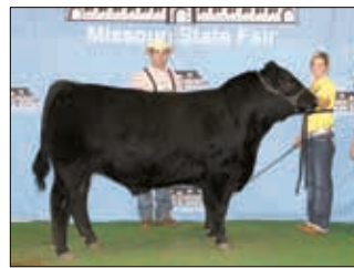
► Reserve junior champion, Hunter's the Voice 213 , by Purebred Livestock Services, Fair Grove.