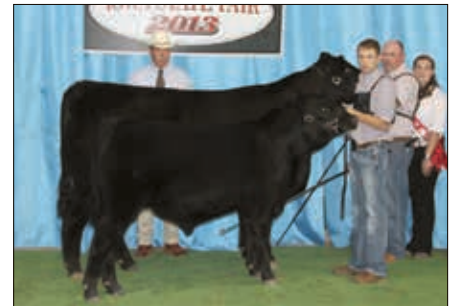
►Grand champion cow-calf pair, ECR Beauty 101 .