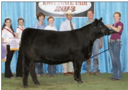
►Reserve grand champion female, Grmn Erica's Belle .