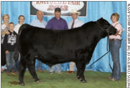
►Grand champion bull, TLF Comanche Moon .