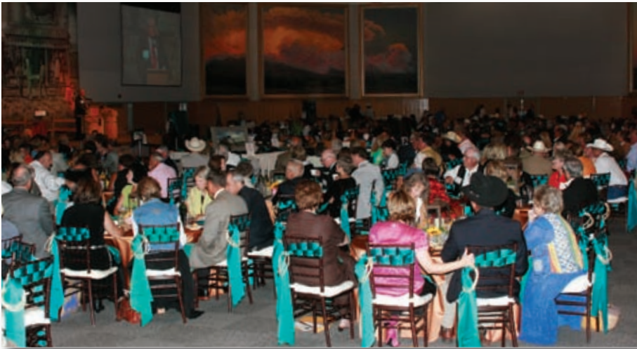
► Above: More than 350 guests filled the Grand Ballroom of the National Cowboy and Western Heritage Museum in Oklahoma City, Okla., to raise money for the Angus Foundation's Vision of Value campaign.