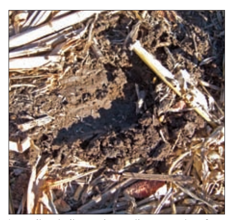
► Studies indicate that soil compaction from cows grazing corn residue is limited to the top 4 to 6 in. of soil.

As the nutritional quality of the corn residue decreases over time, producers may need to provide supplemental protein. Without supplemental protein, digestibility will decrease and the feed will not be able to meet the nutritional requirements of the animal, Wright says. Pay extra attention to protein, vitamin and mineral