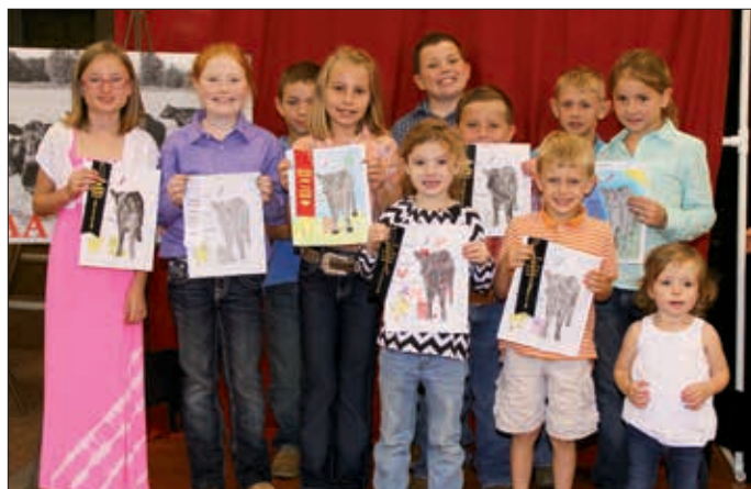
▶These young Angus enthusiasts placed in the coloring contest.