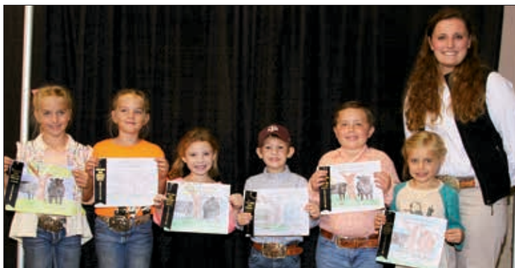
▶ These young Angus enthusiasts participated in the peewee coloring contest.