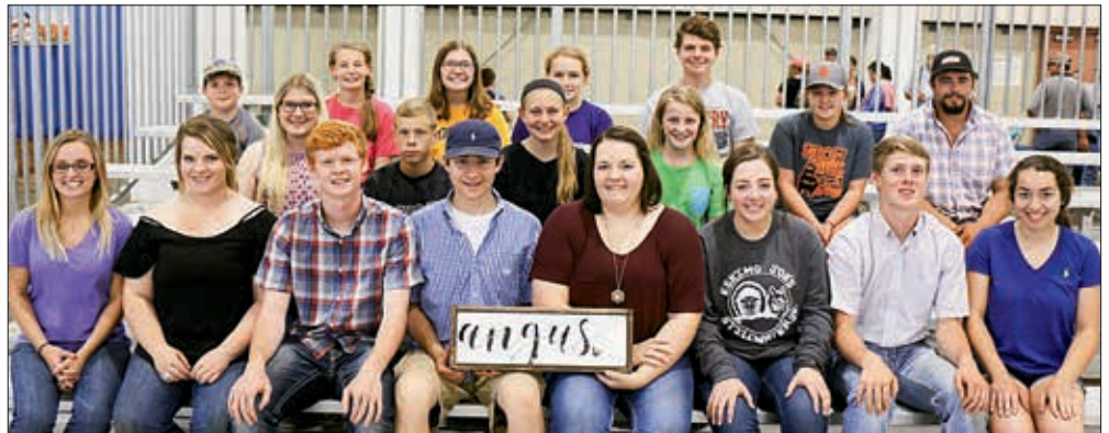
► Northeast Kansas Jr. Angus Show, June 10, Effingham