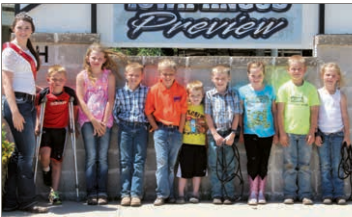
► These young Angus enthusiasts won peewee showmanship honors.