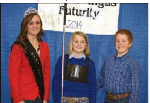
Kansas Angus Futurity Jr. Show, Jan. 26, Hutchinson