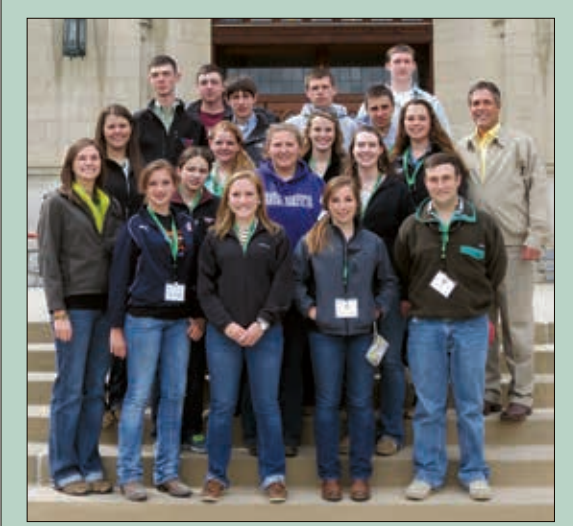
►Angus youth gathered at the 2013 NJAA Raising the Bar Officers Training May 3-5 in Blacksburg, Va. Twenty-four officers and advisors from seven state junior Angus associations participated in the course, geared toward building stronger leaders while forming important regional relationships.

Throughout the weekend, 24 Angus junior leaders, officers and advisors from seven state junior Angus associations toured Virginia Tech and area Angus operations, heard from industry experts, participated in leadership-training workshops and spent an evening bowling on campus.