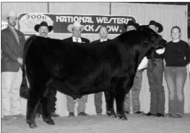
► Grand champion bull, DAJS The Matrix 008 , by Katy Satree, Montague, Texas.

"Katy Satree, Montague, Texas, consigned the grand champion