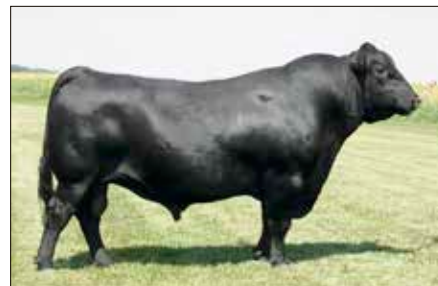
New Design 878

At the turn of the year, 878's production level approached 725,000 units, and he continues to rank in ABS's top 20 bulls for beef semen sales in several regions across the globe. From 2003 through 2006, New Design 878 topped the registration charts as the No. 1 sire for registrations in the Angus breed, still holds the single-year registration record with 10,190 calves registered in 2004, and ranks second (behind N-Bar Emulation EXT) for total lifetime registrations with 52,978 calves through September 2014.