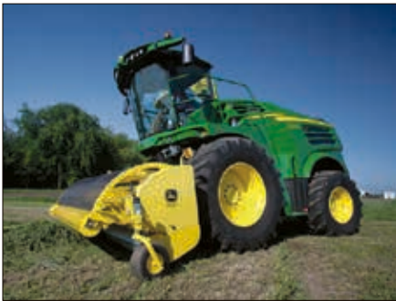
John Deere 8600 self-propelled forage harvester

increase flexibility among different crops and provide better performance in wet or dry conditions. Large 42-inch (in.) tires reduce compaction while providing excellent traction in all types of conditions.