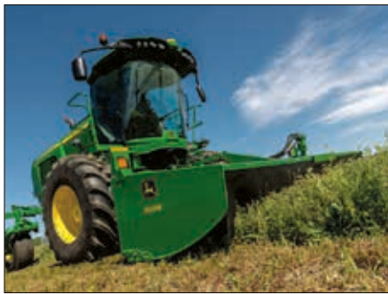
John Deere W260 self-propelled windrower and 500R Platform

Steering performance is improved with integrated AutoTrac, and the independent