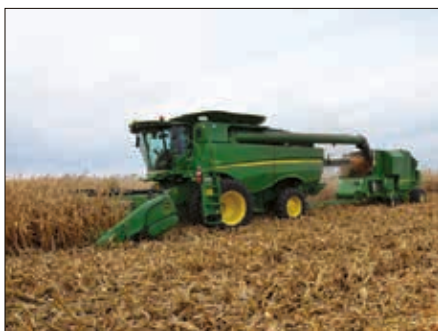
Hillco single-pass round bale system

Hillco Technologies Inc., working in developmental partnership with John Deere, has developed a new system for harvesting corn and baling corn stover in one step. The Hillco Single Pass Round Bale System delivers the next generation of economical corn residue collection with minimal impact on corn-harvesting efficiency and speed. The system is exclusive to John Deere S Series combines and 569 standard round balers.