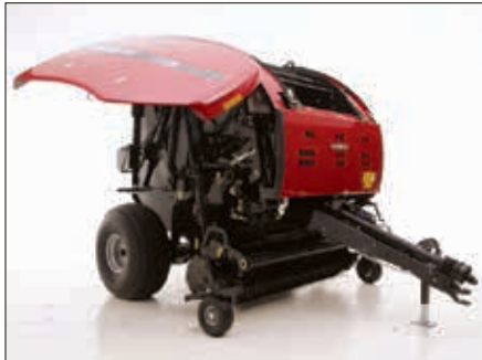
Case IH RB5 Series round baler

The new overshot feeder is standard equipment on the hay, silage, wide pickup and premium configurations. It is located between the pickup and bale chamber and creates a quick and even feed into the bale chamber. The rotor cutter and rotor feeder use an undershot feeder to more aggressively feed the crop into the bale chamber.