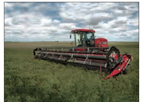
Case IH WD4 windrower

Case IH has introduced new windrowers as part of its full line for 2015. The new Case IH WD4 windrowers offer improved horsepower combined with the company's efficient power technology. The 4-cylinder WD1504 and the 6-cylinder WD2104 and WD2504 deliver 150, 210 and 250 hp, respectively, and are equipped with the