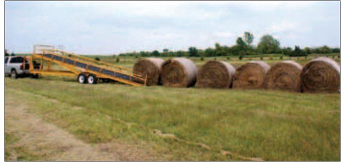
► GoBob HayRoll roller-bed trailer

For more information visit www.magnalight.com or call 1-800-369-6671 or international 1-903-498-3363.