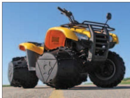
► J-wheelz bolt-on wheel attachment

Contact a dealer at www.trimble.com/agriculture for more information.