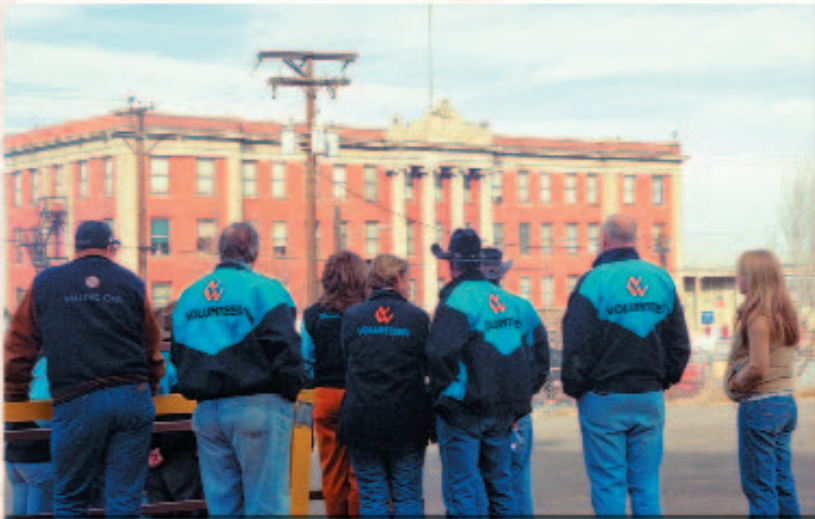
►Above: NWSS volunteers gave tours to celebrate the 100th anniversary.