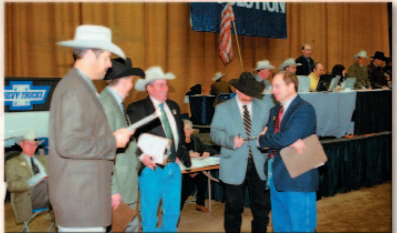
Above: A panel of five judges evaluated 53 sale bulls.