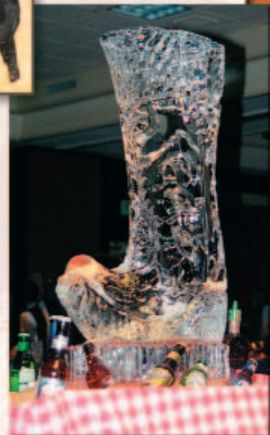
►Above: The Angus Reception provides a place to mingle and catch up on the Angus world.