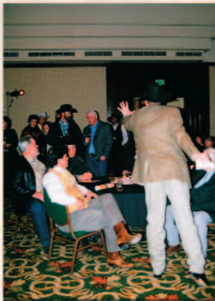
►Right: Producers showed their support for youth by bidding on items to support the NJAS during the Angus Reception Thursday evening.