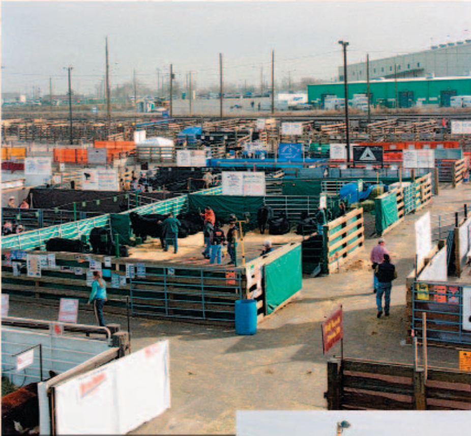
► Above: Cattlemen gather in the yards to see great Angus genetics.