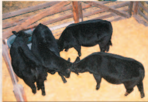
►Left: The brisk January weather brought out the spirit in the yards cattle.