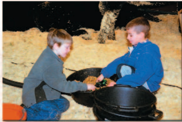
► Angus enthusiasts of all ages turn out for NWSS festivities.