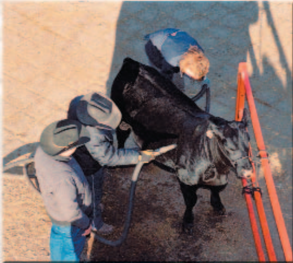
► Above: Yards cattle are kept looking their best to tempt prospective buyers.