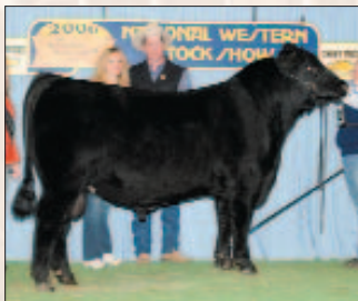
► Fall calf champion, HVR Freedom 430 , by High View Ranch, Council Grove, Kan.