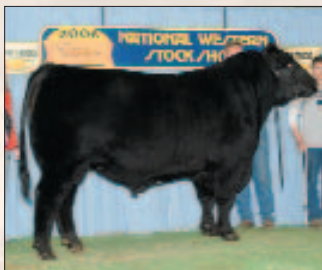
► Senior champion bull, Ascent Freedom N28 , by Therese Miller, Oakland, Ill.

► The day was marked by huge crowds around the showing, as well as prospective buyers examining their options.