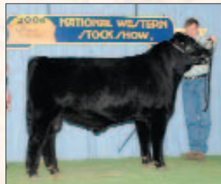
► Reserve late winter calf champion, MF Right Time 55 , by Middlefield Farms, Fort Collins, Colo.