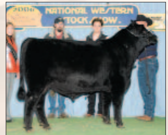
► Reserve early spring calf champion, Westward Special Brew 502W , by Westward Angus, Eldorado, Ohio.