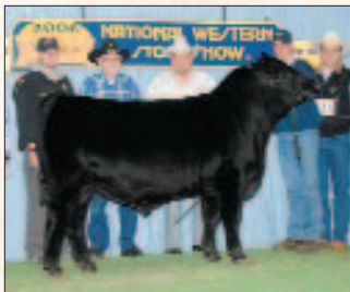
► Late winter calf champion and high-selling bull, Whitestone Par Three U065 , by Whitestone Farm, Aldie, Va.