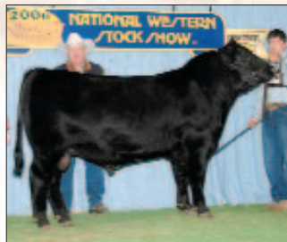
► Late intermediate champion, GW Payweight 3604 , by Gary Wall, Baxter, Iowa.