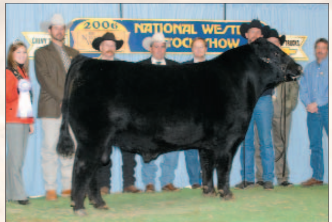
► Reserve grand champion bull, CMC 2002 Midland 4170 , by CMC Cattle, Miami, Okla.