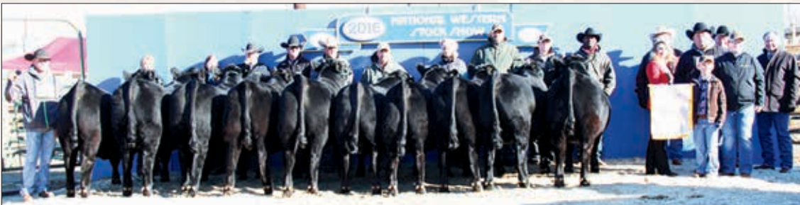
► Left: Reserve grand champion carload, by Vin-Mar Cattle Co.