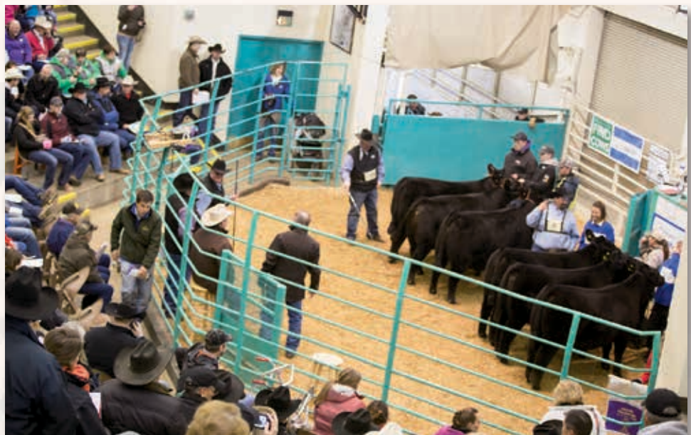
► This year was the inaugural year for heifers in the pen-of-three show.