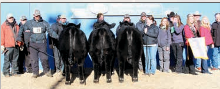
► Reserve grand champion pen of three bulls, by Krebs Ranch .