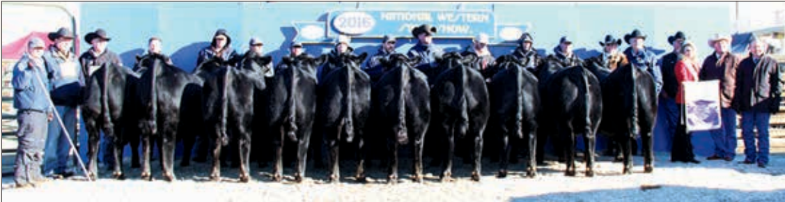
► Left: Grand champion carload, by Express Angus Ranches .