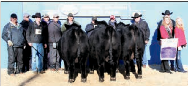
► Grand champion pen of three bulls, by Frey Angus Ranch .