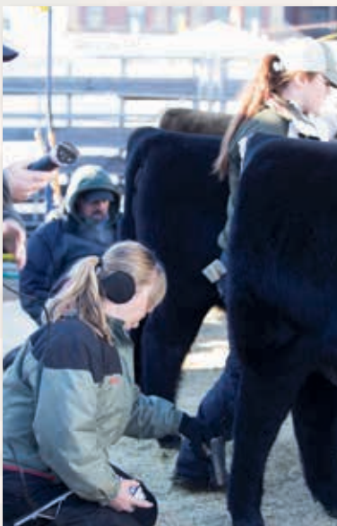
► Teams prepare cattle in the Yards for an event that is only hosted in Denver.