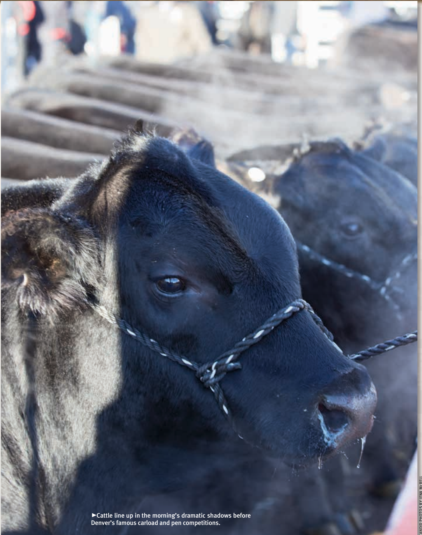
► Cattle line up in the morning's dramatic shadows before Denver's famous carload and pen competitions.