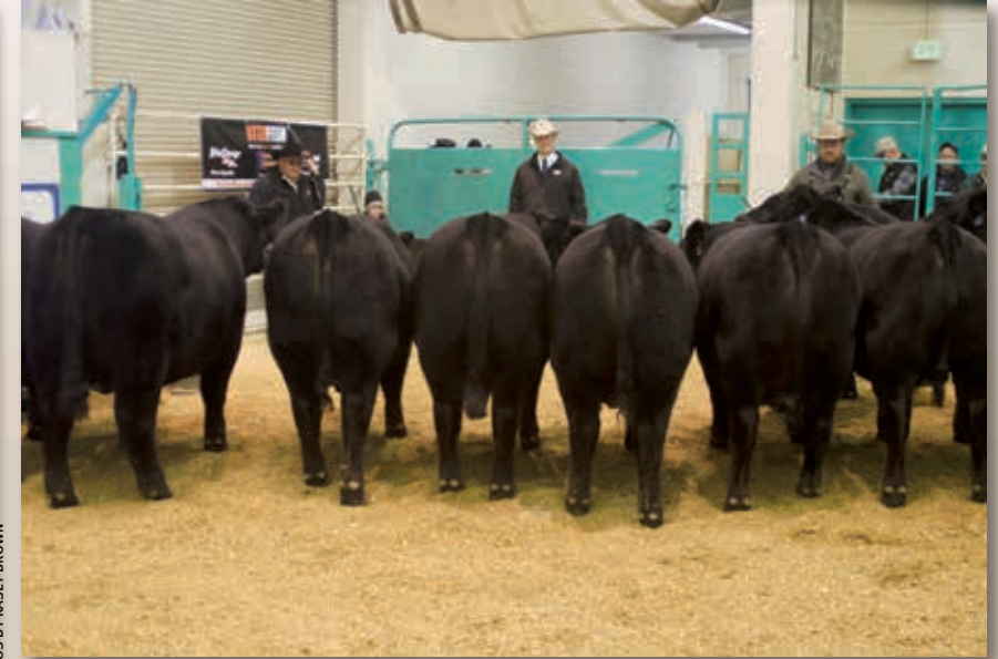
► Above: The carloads brought all 10 bulls into the ring so judges could evaluate the whole group.