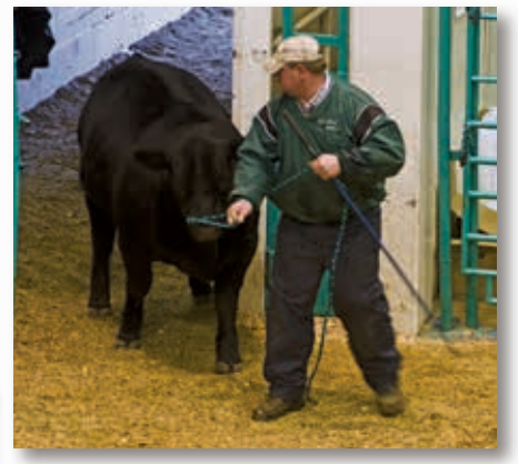
Each bull is first exhibited individually off the halter to walk freely.

► Winner not pictured: Reserve champion yearling pen of three, Werner Angus LLC, Cordova, Ill. The Dec. 2012 and Jan. 2013 bulls posted an average weight of 1,358 lb. and are sired by Connealy Imprint 8317 and SAV Prosperity 9131.