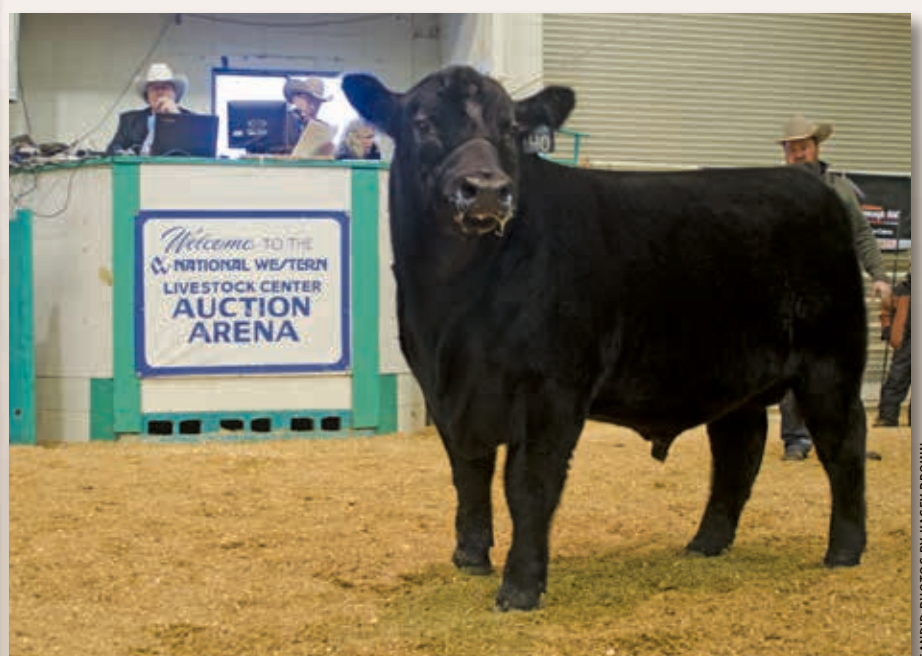
After viewing each bull individually, the whole carload (or pen) is brought back to the ring.

Editor's Note: This article was provided by the American Angus Association.