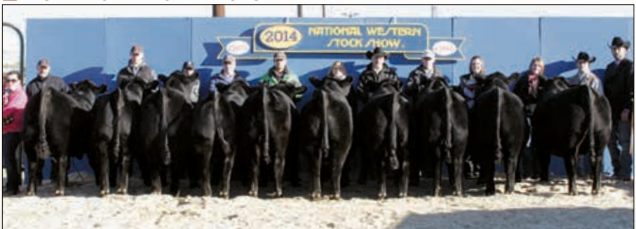
▶ Reserve grand champion carload, by Krebs Ranch.