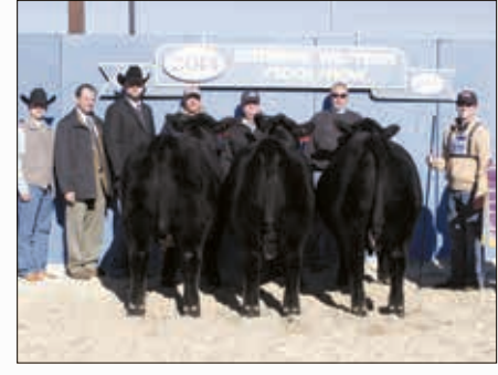
► Grand champion pen, by Bush Angus.