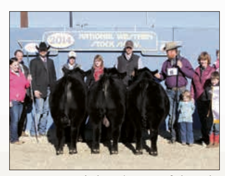
► Reserve grand champion pen of three, by Krebs Ranch.