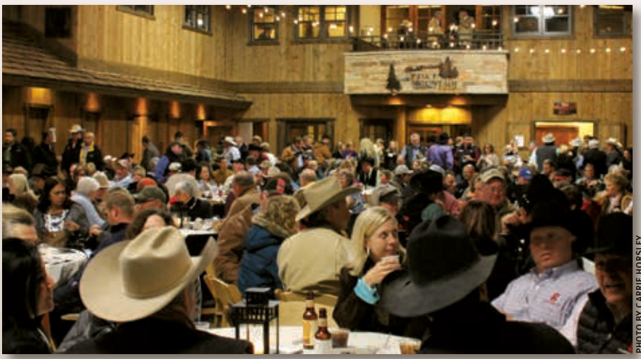
►Thanks to the generosity of many, the Angus Foundation raised $42,000.