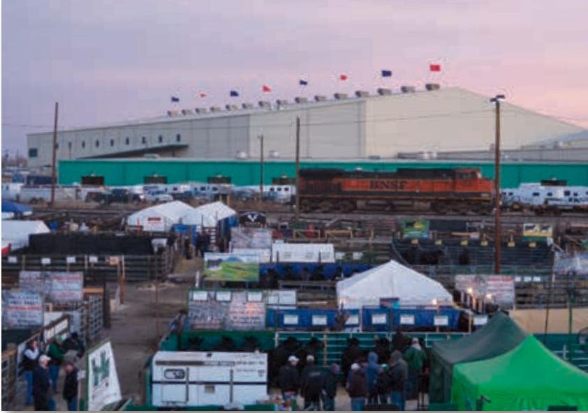
►The Yards is a great place to catch a sunset over the pens.