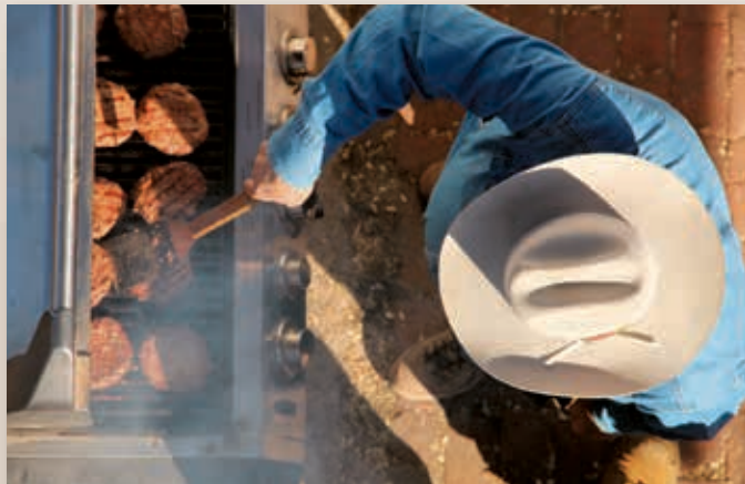
►A busy week calls for some grilled beef.