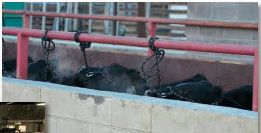
►Bulls are weighed together as a carload on the cold Saturday morning before exhibition.