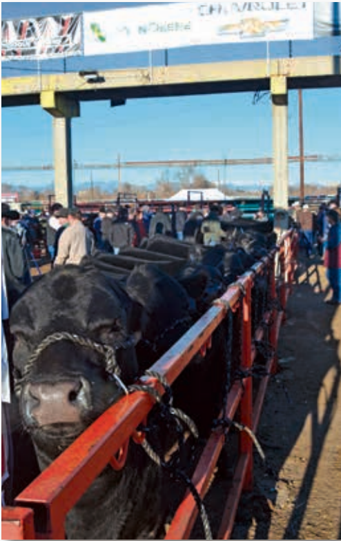
►Above: The bulls soak in sunshine on the chilly Saturday morning after being exhibited in the carload show.