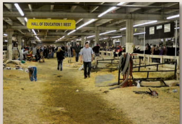
►The stalls on the Hill come down quickly Friday evening after the ROV female show.