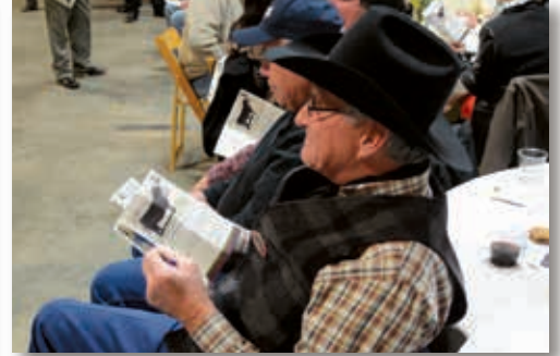
►Angus Night on the Mountain at Spruce Mountain Ranch offered many packages and cattle on which attendees could bid.