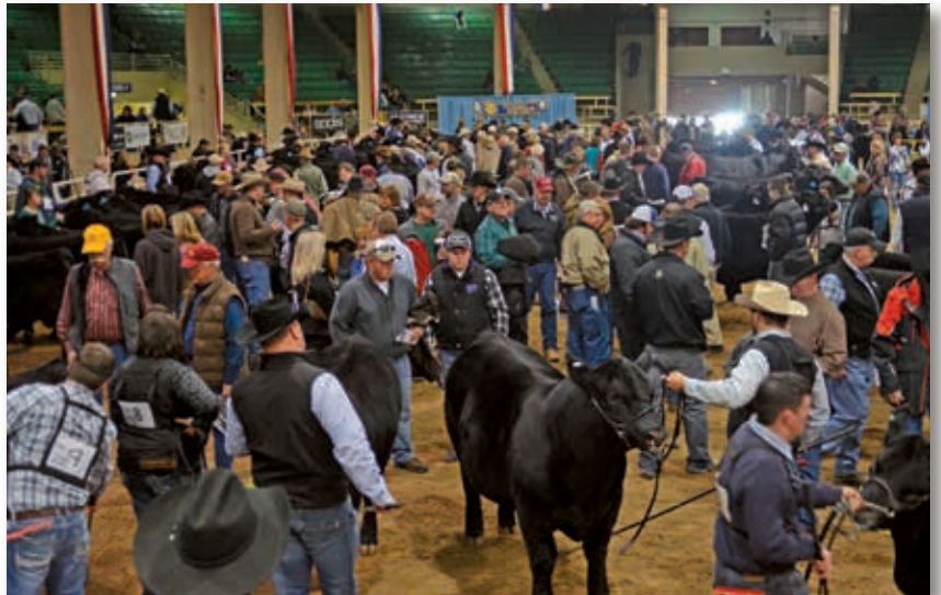
►Prospective buyers evaluate bulls entered in the Bull Sale Show after conclusion of judging Wednesday morning.