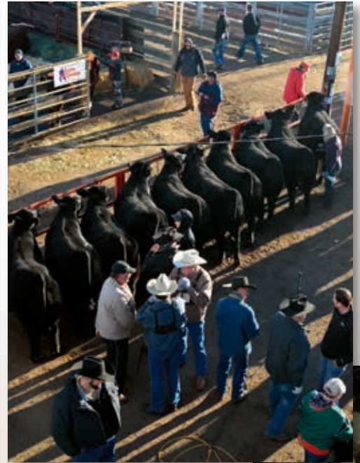
►Bulls are tied in the makeup area after exhibition in the carload show.