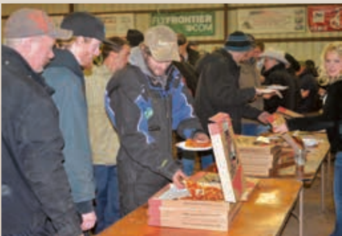
►Herdsman enjoy pizza Monday night at the American Angus Association's Herdsman Social. Ballots for the Herdsman of the Year award are turned in here.