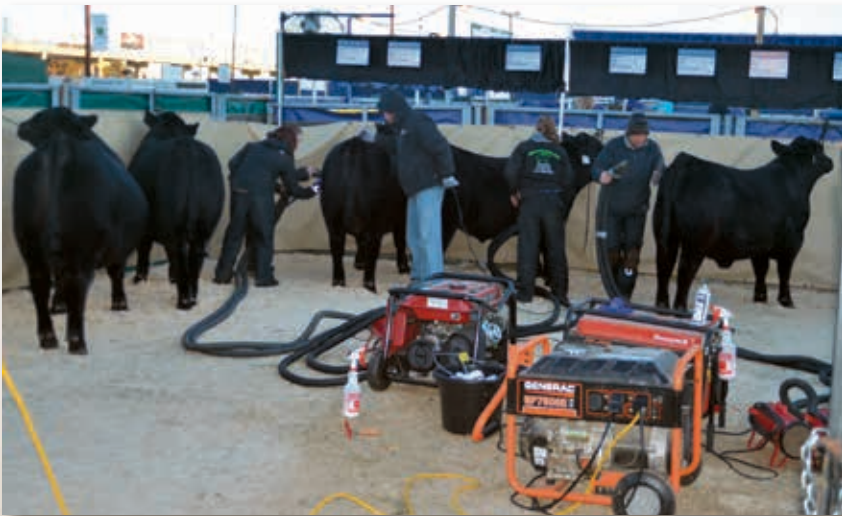
►Fitting cattle in the Yards is the same as on the Hill, just in a different climate.