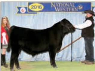
► Reserve late winter calf champion division 2, North Camp Silver Star 5103 , by Guy Lafin.