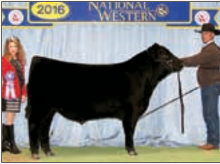
► Spring calf champion, K Bar D Joe Dirt 20C , by K Bar D.