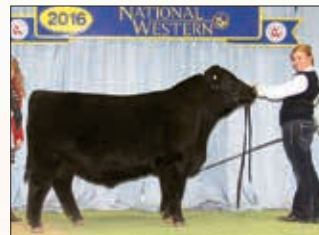
► Reserve early winter calf champion, Marda Unanimous 579 , by Marda Angus Farm, Lodi, Wis.