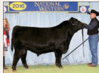
► Reserve senior calf champion division 2, Cherry Knoll Product 1476 , by Cherry Knoll Farm Inc., West Grove, Pa.