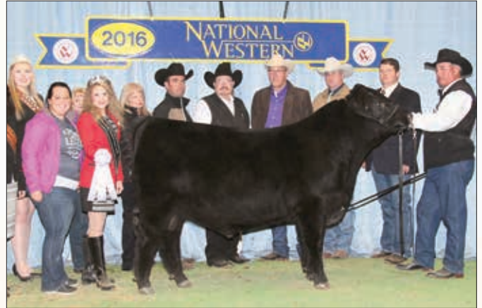
► Reserve grand champion, Silveira's Western Light 5309.