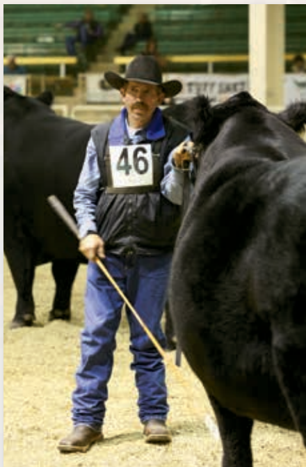
► The only sale managed by the Association, the bull sale's show allows spectators to evaluate the bulls themselves after judging.