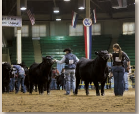
► Angus enthusiasts consigned 39 bulls to the 2013 National Western Angus Bull Sale.