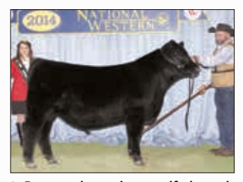
▶ Reserve late winter calf champion, North Camp Ez Answer 3104 , by North Camp Angus Ranch, Saint Ignatius, Mont.