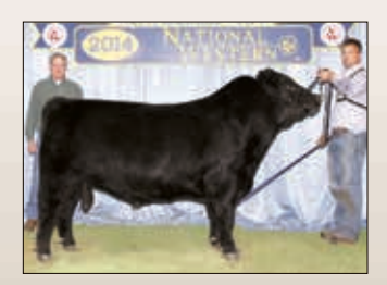
► Reserve intermediate champion, HBL Indian 2740 , by Kaley Bockhop, Belmont, Wis.