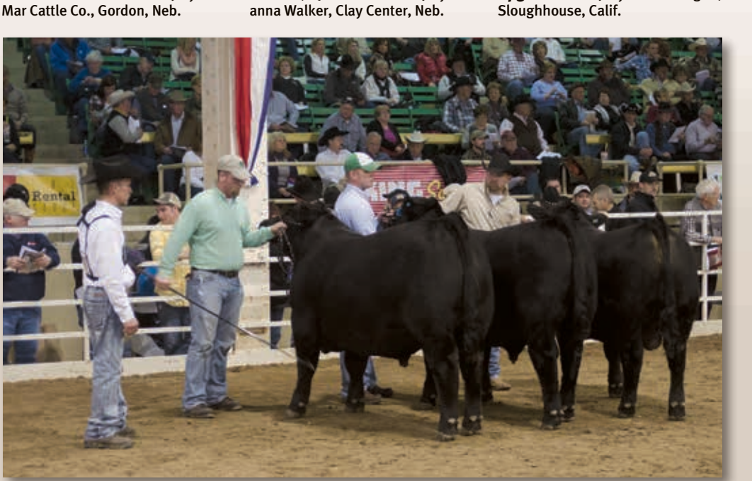
► Two entries offered the pick of the pen to the buyers.