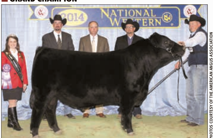
► Grand champion bull, EXAR First Advance 5702B.