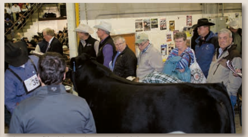
► Vin-Mar Confidential 206 waits to enter the salering.