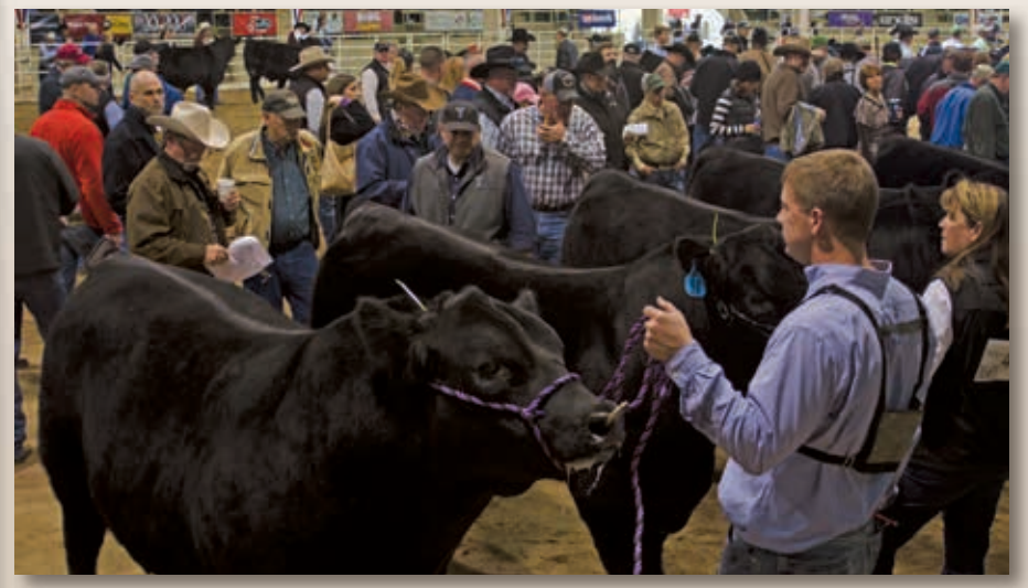
► Spectators were able to get a close-up view of the bulls after the show as they were all brought into the ring for inspection. The 39 bulls brought a total of $278,500 and averaged $7,141.

Editor's Note: This article was provided by the American Angus Association.