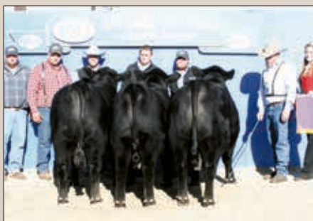
► Left: Champion yearling pen of three, by JAC's Ranch , Bentonville, Ark. The Sept. and Oct. 2011 bulls averaged 1,630 lb. and were sired by Vin-Mar O'Reilly Factor; Sitz Dash 10277; and SAV Pioneer 7301.