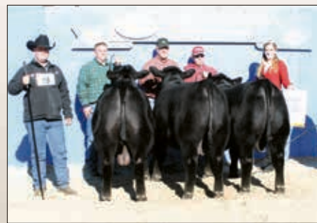
► Right: Reserve early calf champion pen of three, Sauk Valley Angus , Rock Falls, Ill. The Jan. and Feb. 2012 bulls averaged 1,278 lb. and are sired by Sitz Upward 307R and Whitestone Black Arrow Z101.