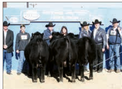
► Reserve grand champion pen of three, by Express Angus Ranches , Yukon, Okla.