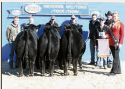
► Left: Reserve late calf champion pen of three, Bush Angus , Britton, S.D. The Feb. and March 2012 bulls averaged 1,342 lb. and were sired by Bush's Unbelievable 423 and Connealy Consensus 7229.