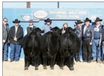
► Grand champion carload, by Express Angus Ranches , Yukon, Okla.