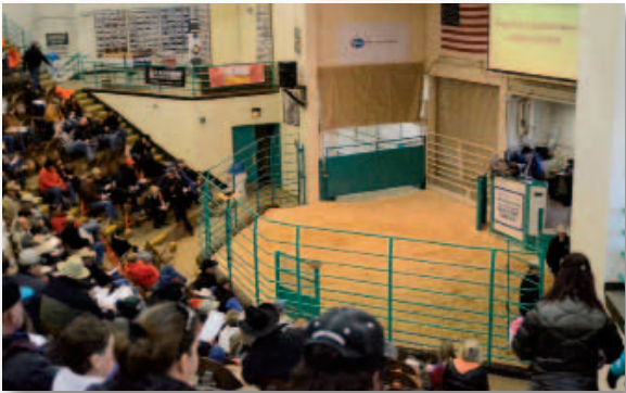
►Above: There was a full house to see the unique-to-NWSS pen and carload show in the Yards on Saturday morning.