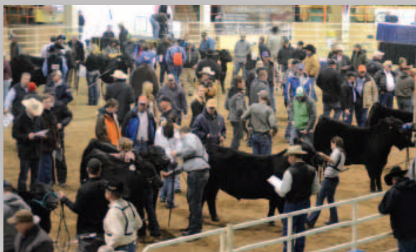
► Right: Spectators and prospective bull buyers were allowed into the ring to evaluate bulls before the sale.