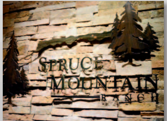
►Above: More than 500 people attended the Angus Night on the Mountain at Spruce Mountain Ranch.