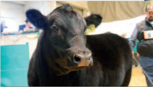
►Left: Bulls in the pen of three classes are shown without halters so the panel of judges can see all aspects of the bulls.