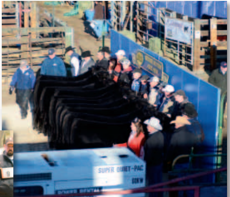
►Above: Express Angus Ranches, Yukon, Okla., exhibited the grand champion carload Saturday morning.