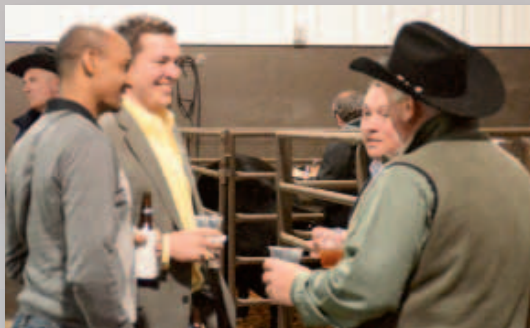
►Right: Producers shared ideas at the Angus Night on the Mountain Angus Foundation event at Spruce Mountain Ranch Wednesday night.