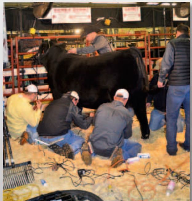
►Above: A bull in the Gamble showstring is primed in the stalls for the ROV bull show Wednesday.