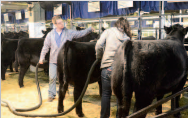
► Above: A few minutes in the ring requires hours of effort in the stall.