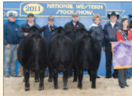
► Grand champion pen, by Express Ranches , Yukon, Okla.