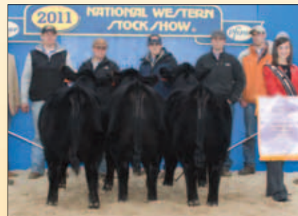
► Reserve grand champion pen, by Oklahoma State University , Stillwater, Okla.