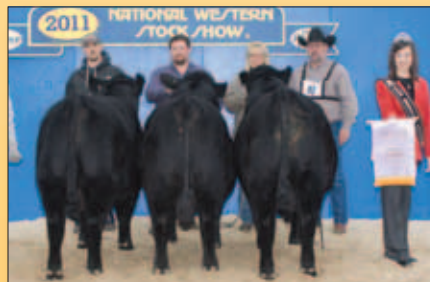
► Reserve champion yearling pen, by Pollard Farms LLC , Enid, Okla. The Aug.-Sept. 2009 sons of Garden's Prime Star and SAV Bismarck 5682 averaged 1,658 lb.