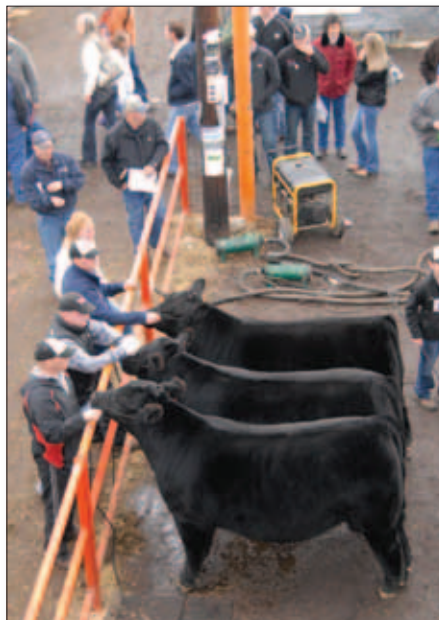
►Below: Judges and cattlemen had opportunity to view the entries outside in the daylight, as well.