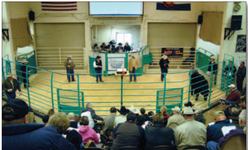
►Above: Judges evaluate a bull on the move in the ring during the Pen and Carload Show as the audience looks on.

Photos of the champions and reserve champions follow. To see a complete list of winners, including class placings, visit www.angus.org/showresults/denver/2011/index.html .