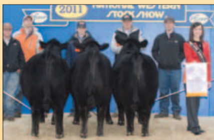
► Reserve early calf champion pen of three, by Oklahoma State University , Stillwater, Okla. The Jan.-Feb. 2010 sons of Stevenson Mon-eymaker R185, EXAR Titlelist T011 and Rito 6EM3 of 4L1 Emblazon averaged 1,283 lb.