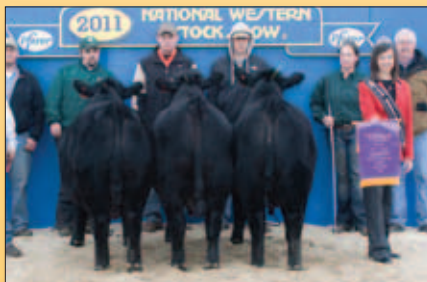
► Champion yearling pen of three, by Werner Angus , Cordova, Ill. The Dec. 2009 and Jan. 2010 bulls averaged 1,375 lb. and are sired by SAV Final Answer 0035, SAV 8180 Traveler 004 and DHD Traveler 6807.