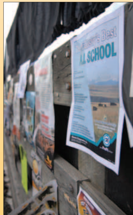
► Cattlemen and allied industry posted promotional fliers to the pens in the main alleys during the NWSS.