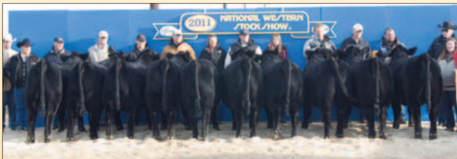
► Reserve grand champion carload, by Whitestone-Krebs , Gordon, Neb.