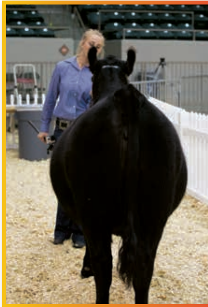
► When stopping the animal, she demonstrates, it's important to keep the head up and straight in line with the back.