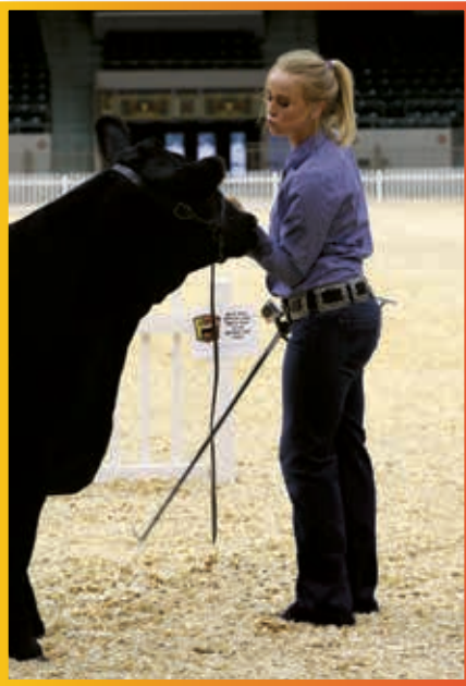
► When showing Angus cattle, it's best to have the ears facing forward, also referred to as "true ears." Keyes recommends that after setting up the calf's feet and legs, lightly blowing on the animal's nose can get them to move their ears forward to polish off the look.