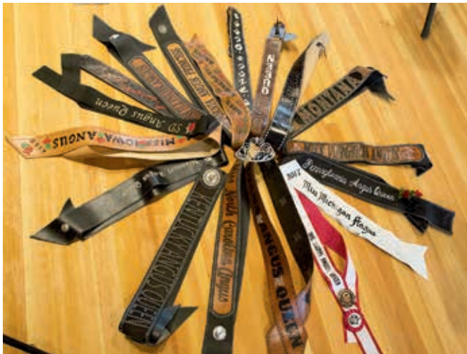
► Below: Sashes worn by the Angus queens are displayed around the Miss American Angus crown at the Queens' Luncheon.