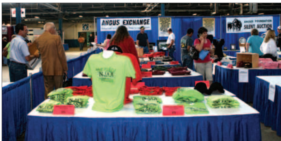
► In an area near the silent auction, the Angus Foundation offered various merchandise, including this popular T-shirt.