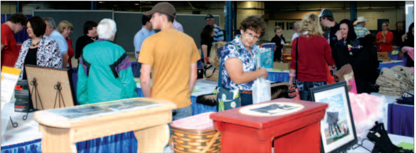
► Angus enthusiasts look over silent auction items donated by individuals and state junior associations.

The Natural Vet, Unicoi, Tenn. Weaverland Valley Farms, New Holland, Pa. West Virginia Junior Angus Ass'n Wisconsin Junior Angus Ass'n