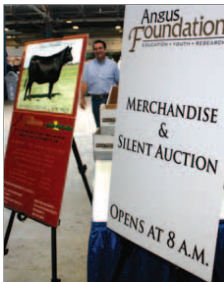
► This was the 16th annual silent auction hosted by the Angus Foundation at the NJAS.