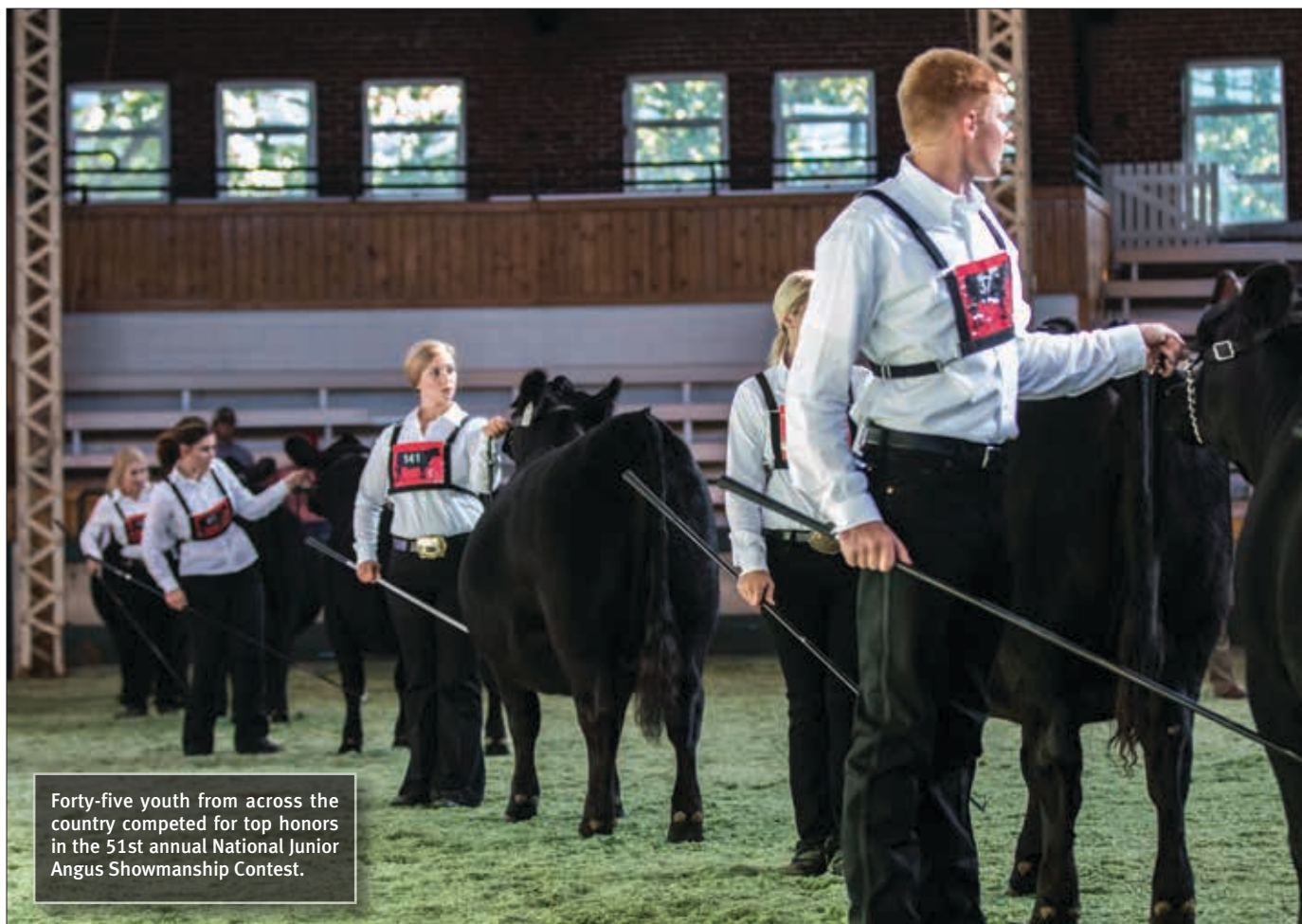
Forty-five youth from across the country competed for top honors in the 51st annual National Junior Angus Showmanship Contest.