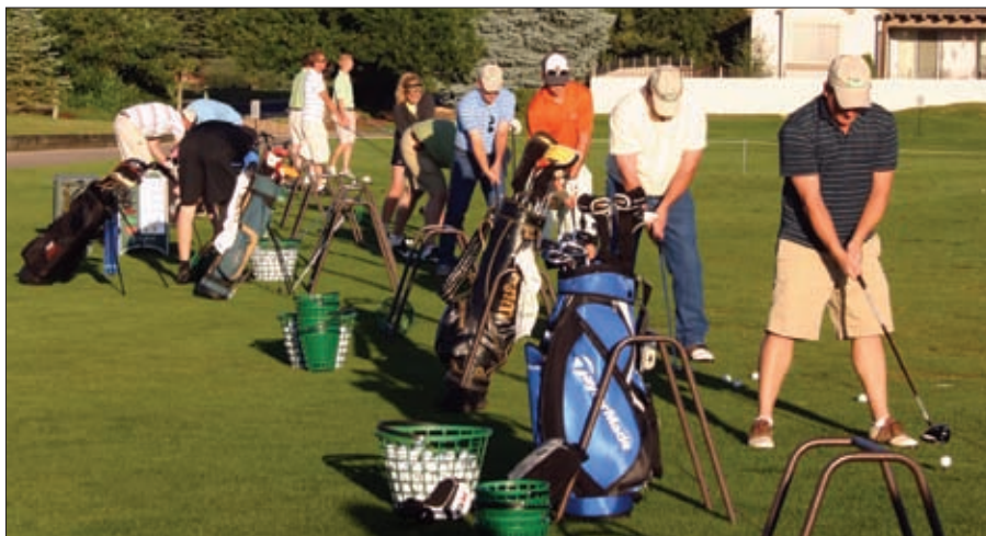
► Golfers take warm-up swings on the driving range before the 10th Annual Foundation Golf Tournament.