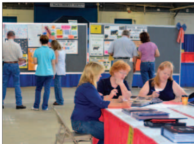
Poster contest and scrapbook