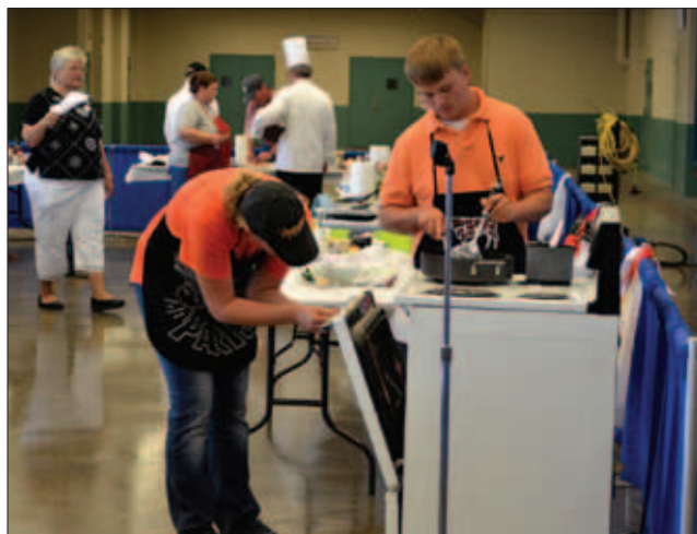
Auxiliary-sponsored All-American CAB® Cook-Off