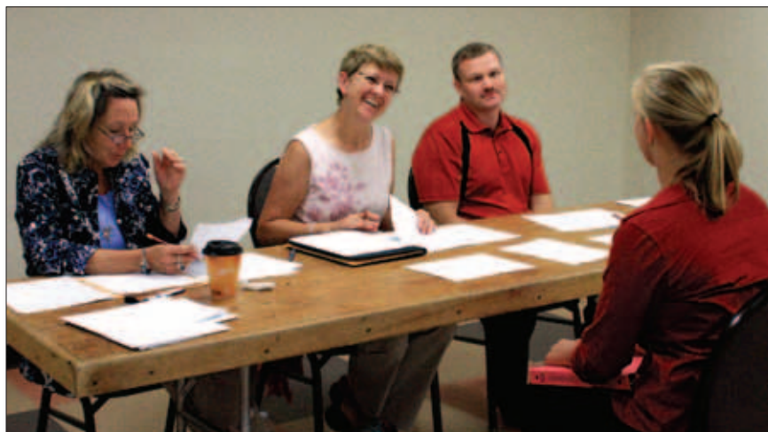
Career development contest

Participants will draw three speech topics,