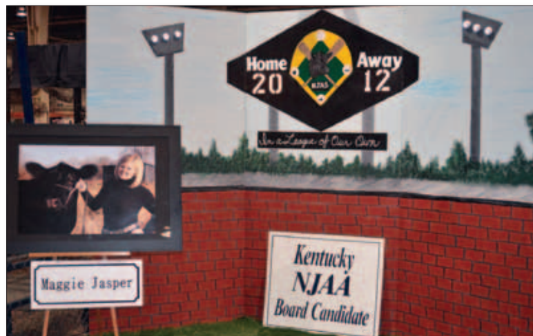
Good luck in Kentucky.