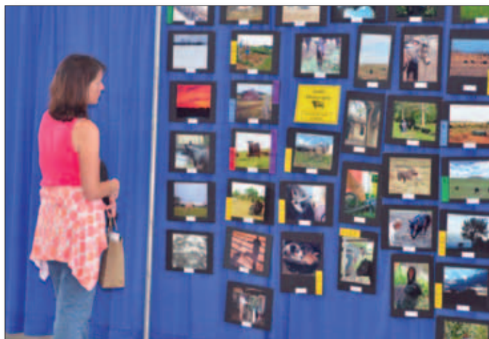
NJAA/Angus Journal Photography Contest