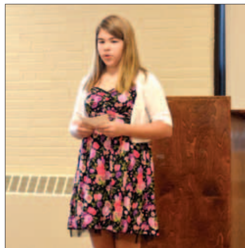
Prepared public speaking