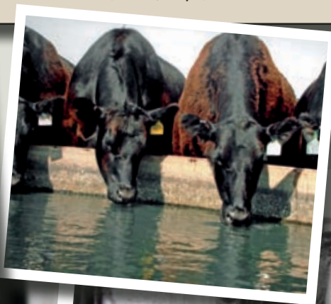
► These pictures are from the 2008 NJAA/Angus Journal Photography Contest.