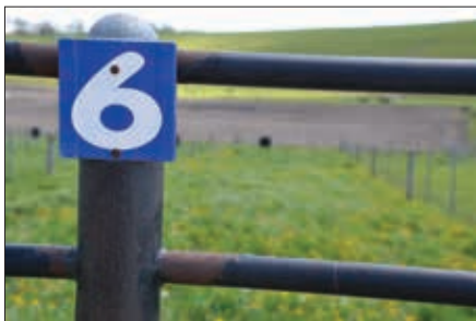
► 3rd: Out in the Donor Pen , by Sierra Day, Cerro Gordo, Ill.

The photo was digitally enhanced to use in show catalogs and presentation about showing cattle.