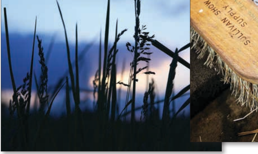
September 2017 Digital Supplement • ANGUSJournal • D7

► Below: Editor's Pick: A Mouse's Point of View, Kyle Houston, Savannah, Mo.